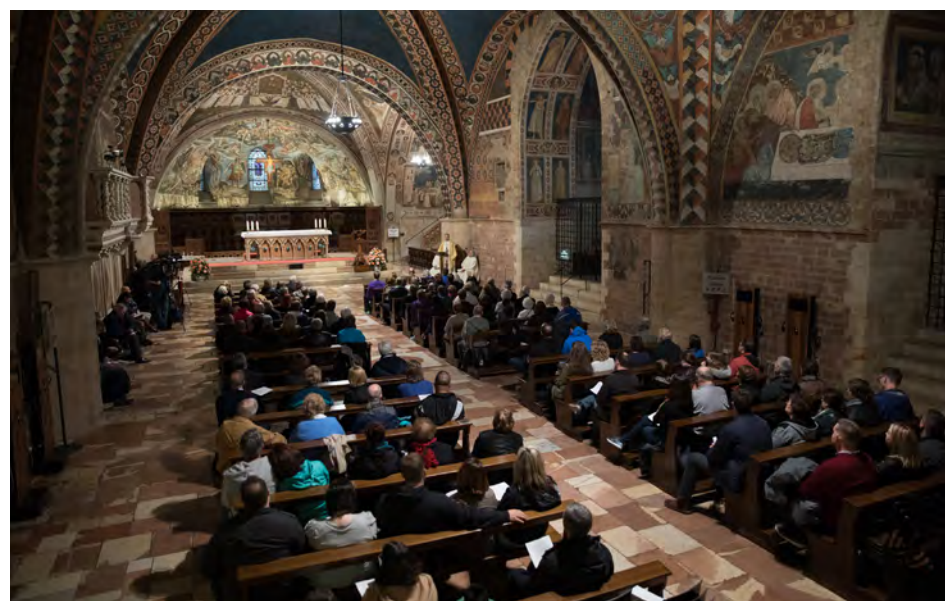
Participants in a Catholic Extension pilgrimage gather for Mass on Nov. 18, 2016 in the lower Basilica of St. Francis in Assisi, Italy. The Mass was celebrated by then-Cardinal-designate Blase J. Cupich, archbishop of Chicago, who the following day was inducted by Pope Francis into the College of Cardinals.

Cardinal Cupich urged pilgrims to "take a moment to reflect on how God has lavished his love on us personally and in that way allow us to have our thanksgiving to have so much more lasting impact than just saying thanks today."