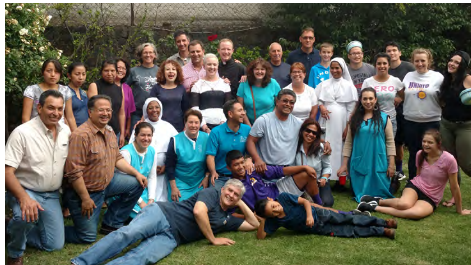
Chillicothe pilgrims with Mexico City Mater Filius staff and residents.

That early-morning addition to our schedule of praying at the abortion clinic proved to be just the way Our Lady wanted to show us how to give not only of our time and resources, but of our whole selves on this trip. It was a way for us to make a sacrifice and receive a great consolation from the Blessed Virgin that she really does hear our prayers.