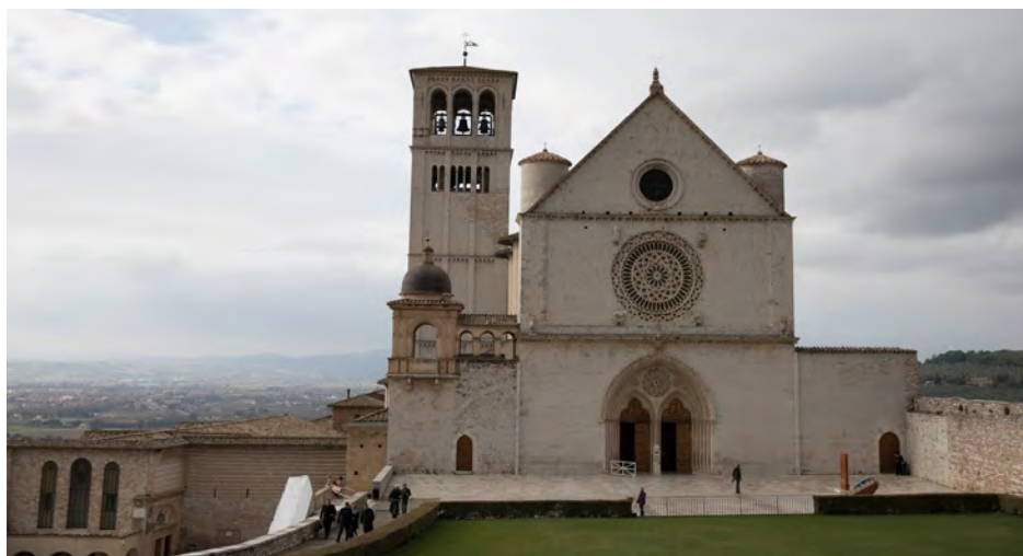
The Basilica of St. Francis in Assisi, Italy, in a photo taken on Nov. 17, 2016. Participants in a Catholic Extension pilgrimage gathered for Mass the next day in the lower basilica.

For the church in this moment, he said, "unity is prior. We must come together. Contemporary society so often divides us." Rather than focusing on differences among people, the cardinal quoted Pope Francis, "who has been reminding us that what counts is the fact that we are