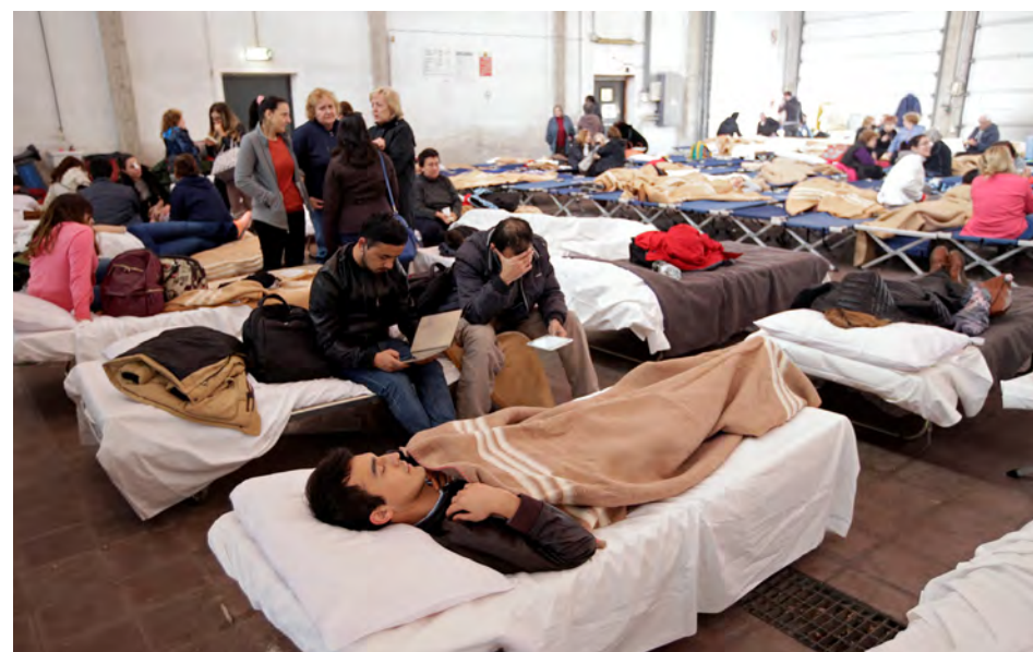
Left: A collapsed church in Borgo Sant’Antonio, Italy, one day after the Oct. 26, 2016 earthquake. Right: People rest in a hangar used for recovery in Camerino, Italy.