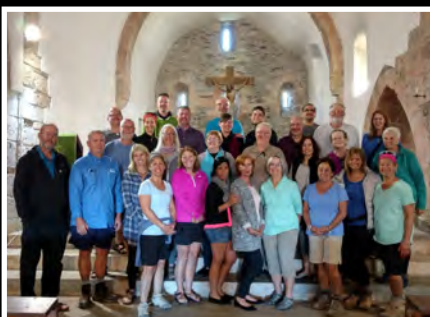
A group from Sunbury St. John Neumann Church and other diocesan parishes in a church along the Camino de Santiago pilgrimage route in Spain in October 2016.