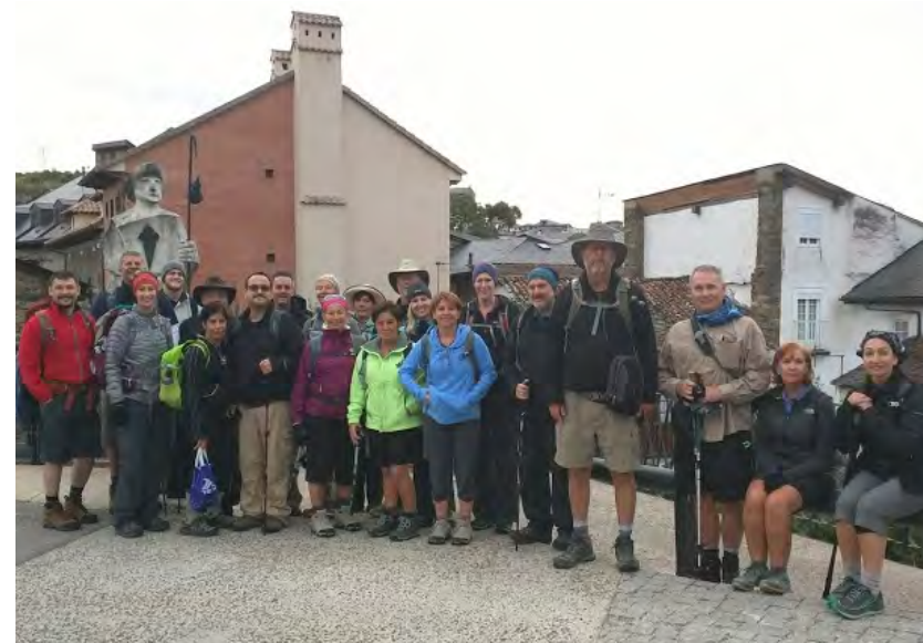
Top: Camino pilgrims from Sunbury and Columbus. Right: A typical scene for Camino pilgrims walking through the Spanish countryside, with a town in view.

Our excitement built as we toured this beautiful city at the foot of the Pyrenees Mountains, and on Sept. 6, we took our first steps on the Way of St. James. Our first destination was Orisson, France. We walked five miles that day in 95-degree heat, 3,500 feet up into the Pyrenees Mountains. The switchbacks and elevation were endless and the heat almost unbearable, but the amazing thing was the amount of people we met that day from Germany, Canada, England, Norway, and many more nations, who joined us on this journey with the same excitement in their hearts for this amazing experience, each with their own reasons for completing this journey.