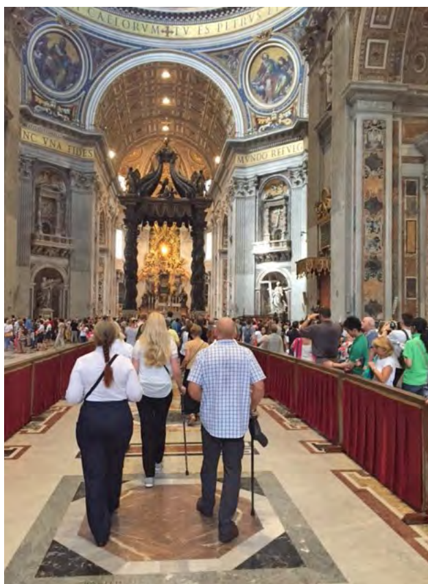
Pilgrims on St. Peter's Basilica center aisle.

I prepared myself for public moments of anxiety by practicing what I would do to keep calm. My mantra was "Do as your spirit guides. Become aware of your surroundings, become aware of yourself, be still, and