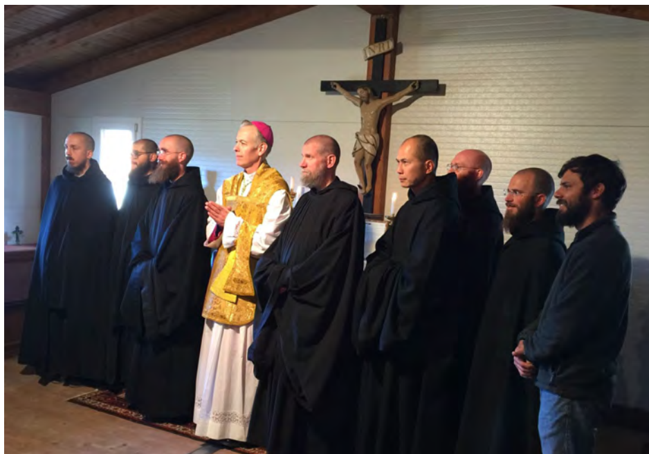
Archbishop Alexander Sample of Portland, Oregon, poses with Benedictine monks after celebrating Mass at the San Benedetto in Monte monastery overlooking Norcia, Italy, on Oct. 27, 2016. An earthquake struck Norcia the previous day.

Speaking by telephone from Norcia, the archbishop said that despite feeling aftershocks during the Mass, he finished celebrating and was in his hotel room when the second earthquake struck.