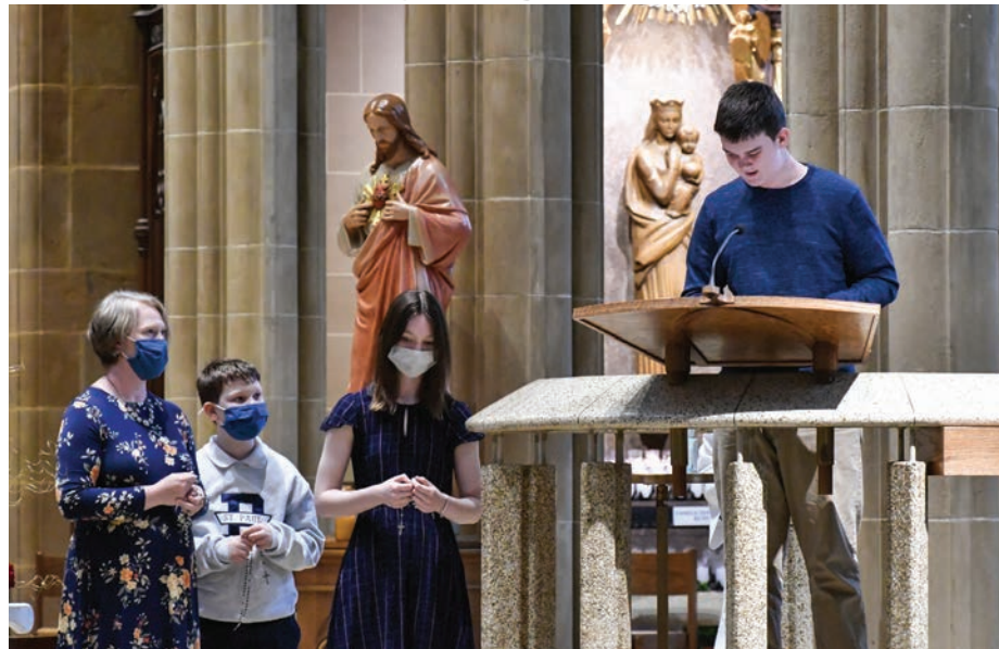
In place of the Family Rosary Sunday held last year at St. Joseph Cathedral, the Office of Marriage and Family Life is encouraging parishes throughout the diocese to promote praying the rosary individually, as a family or in groups on a Zoom conference call on Sunday, Oct. 11.

A second option is a virtual family rosary in which every household in a