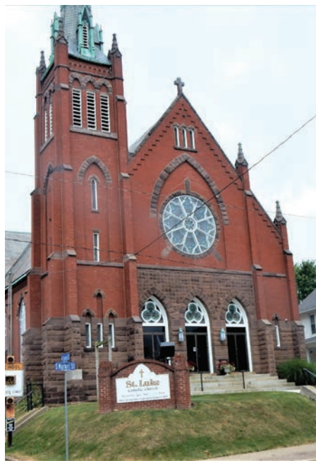
Danville St. Luke Church