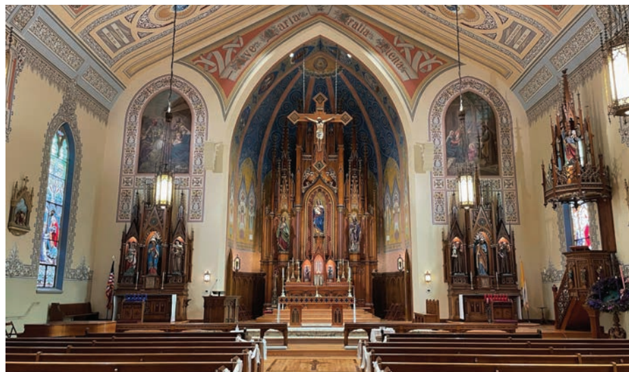
St. Mary Church in the German Village area of Columbus is launching a concert series featuring a variety of artists starting Oct. 17.

"That's a big word on the campus of any parish, and so we're trying to help people encounter God in many different ways. That's one aspect of