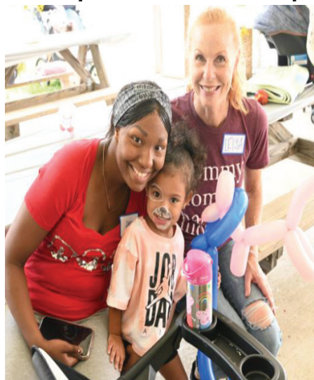
Mommies Matter helps support women who choose life for their children.