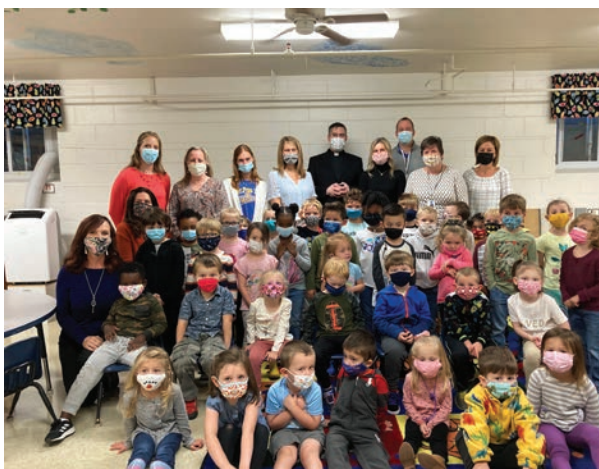
Pictured are children and staff members at Reynoldsburg St. Pius X Church Preschool.

Their schedules are coordinated, allowing all-day students to arrive as early as 7:30 a.m., and their cal-