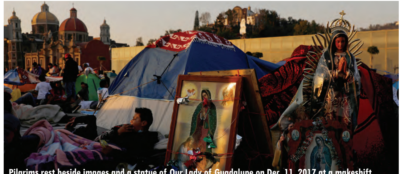
Pilgrims rest beside images and a statue of Our Lady of Guadalupe on Dec. 11, 2017 at a makeshift campsite outside the basilica bearing her name in Mexico City.

Era el 9 de diciembre de 1531, pocos años después de la Colonización Española en México, cuando un humilde indígena convertido se dirigía hacia la Iglesia en Tenochtitlan (Hoy Ciudad de México) para la Misa del día. Hacía frio y él llevaba puesta su tilma para protegerse un poco del clima.