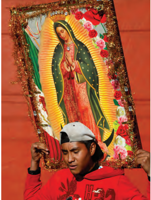
2017 Guadalupe feast in Mexico City.

Portsmouth Holy Redeemer and St. Mary – Re-enactment of Mary's ap-