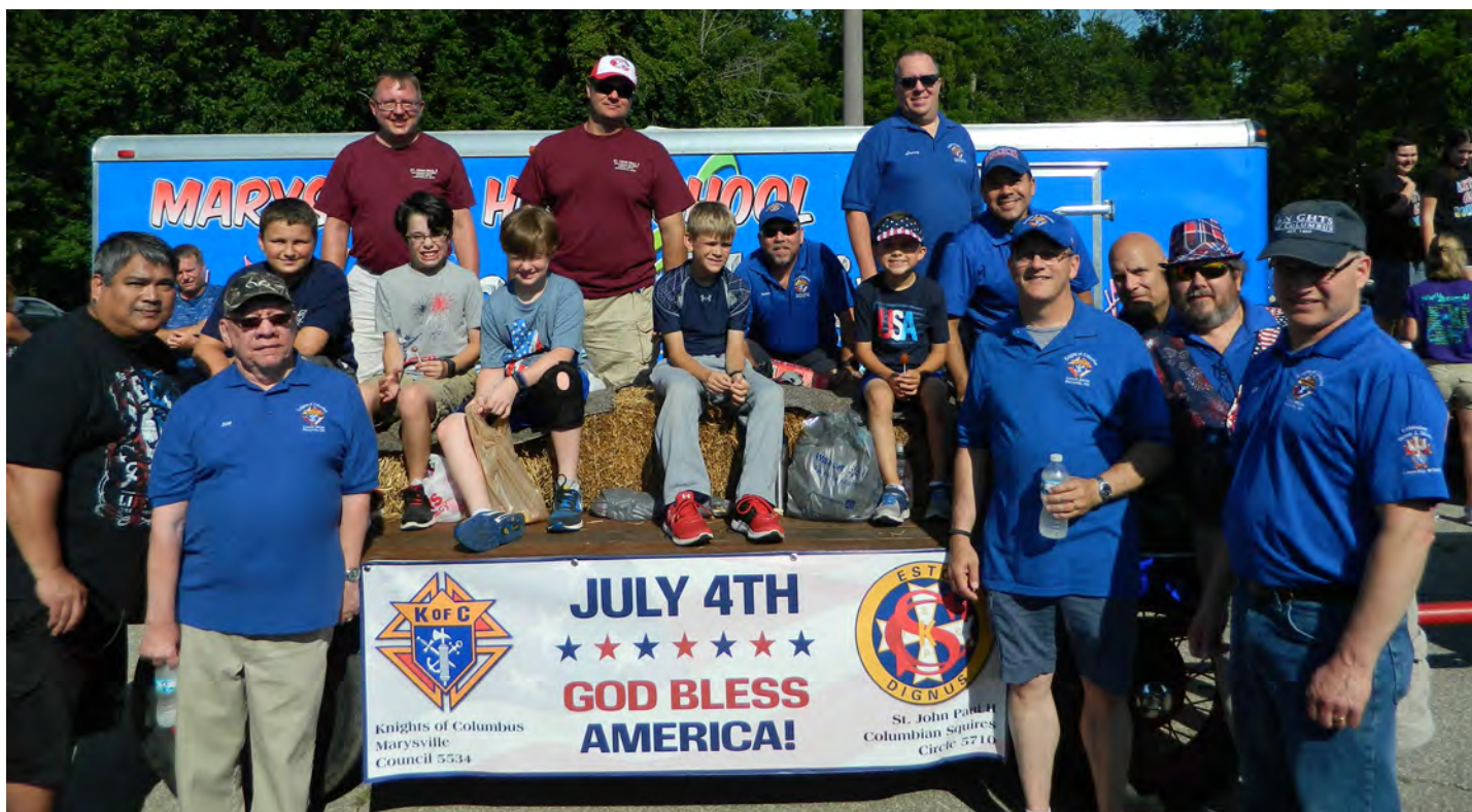
Knights of Columbus and Columbian Squires at Marysville’s Independence Day parade.

Council 5534 is one of the relatively few councils that sponsors groups for