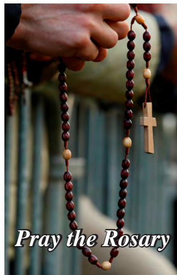
Pray the Rosary

The parish website is www.stpatrickcolumbus.org .