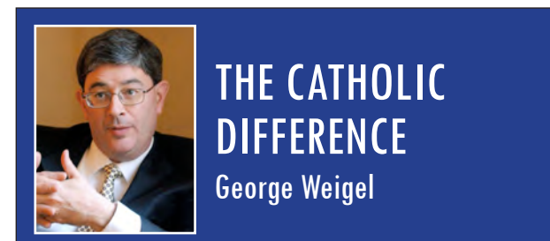
THE CATHOLIC DIFFERENCE George Weigel

Over three decades of friendship and collaboration, I’ve come to think of Yigal Carmon as the contemporary reincarnation of an ancient Stoic. He is completely tone-deaf religiously: not hostile to religious belief, perhaps even admiring it in others, but incapable of it himself. Yet he is a man of the utmost moral seriousness, determined to see things as they are and to live in an ethically