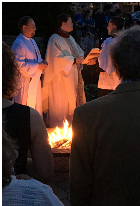
Easter Vigil service at Our Lady of Lourdes.