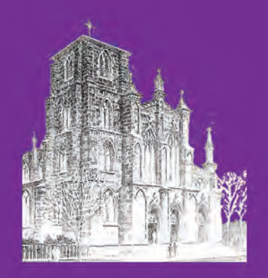
DIOCESE OF COLUMBUS