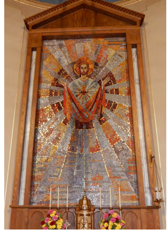
Left: A monument and flagpole dedicated to New Philadelphia Sacred Heart Church military veterans includes the cross which stood atop the former parish school. Right: A mosaic which has been at the rear of the church's sanctuary since 1966.