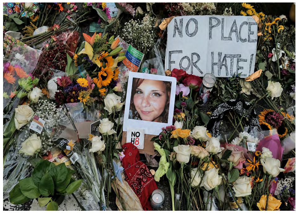
A photograph of victim Heather Heyer is seen on Aug. 14 among flowers where the car attack on a group of white nationalist counter-protesters took place on Aug. 12 in Charlottesville, Virginia. Heyer was killed when a car was driven into the crowd.

The following day, at least 20 were injured and the mayor of Charlottesville confirmed Heyer's death later that afternoon via Twitter after the car allegedly driven by Fields rammed into the crowd of marchers. Two Virginia State Police troopers also died when a helicopter they were in crashed while trying to help with the violent events on the ground. CNN