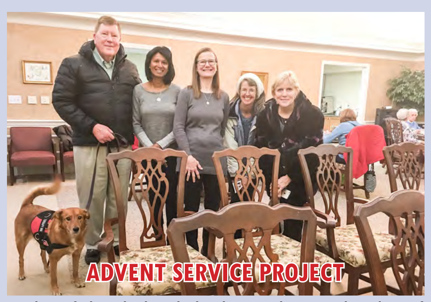
Members of the Columbus Third Order Carmelites visited residents of The Villas of St. Therese as part of the lay Carmelite community's Advent service project.