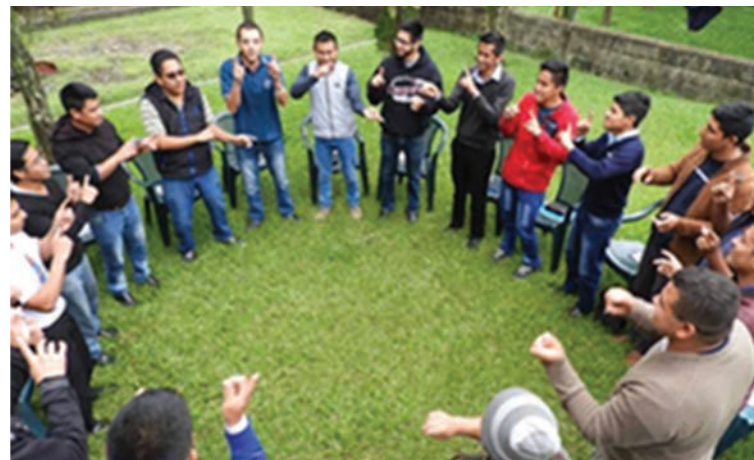
A workshop for boys at the Missionary Fraternity of Mary's seminary in Guatemala City.