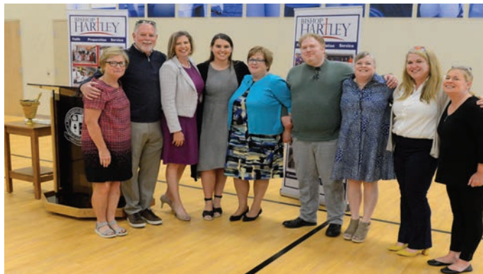
Telerski and Casson family members attended the dedication.