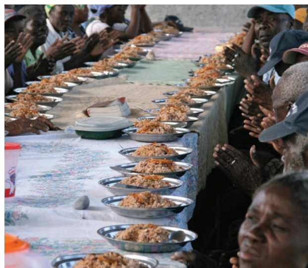
Feeding the elderly is one of the many aspects of Hands Together's mission in Haiti.