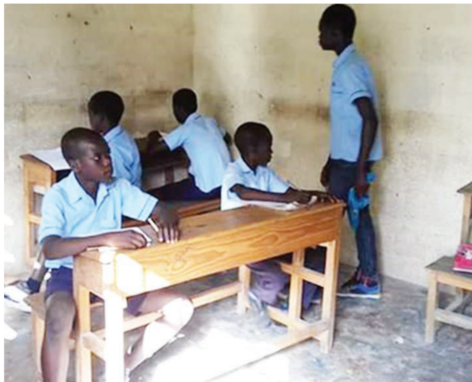
Seventh-grade students at the La Salette School in Bayonnais, Haiti.

Fortunately, the Catholic Church is present everywhere in the nation, and has been for centuries. Almost all Haitians call themselves Christians, if not Catholics. The Church played a very important role in Haitian society. With the help of benefactors and donations from churches in foreign countries, especially the United States, the Church