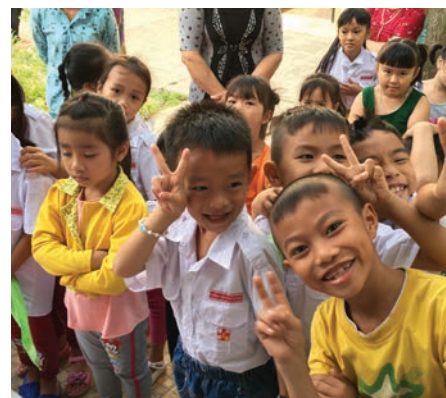
Children of the Tra Ech mission.

He baptized thousands of people in Rach Suc and constantly worked to bring people to the Church. By 2009, a new church building was built, providing a place large enough for the thousands of pilgrims who visit Rach