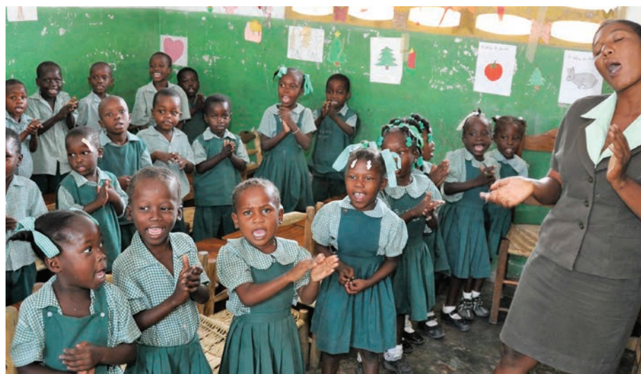
Hands Together provides Catholic schooling to more than 12,000 of Haiti's poorest children, who attend 11 free schools in rural and urban areas.