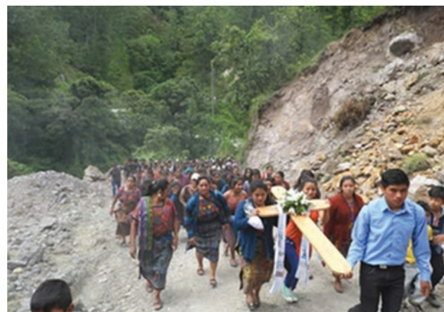
Youth evangelization in San Juan Comalapa, Guatemala.

that there is life and safety at home, so they don't feel the need to emigrate to the United States. This is designed to benefit the home nations of those youths by having them contribute to the places where they live and to benefit the United States by reducing the strain caused by having so many people leaving their homelands.