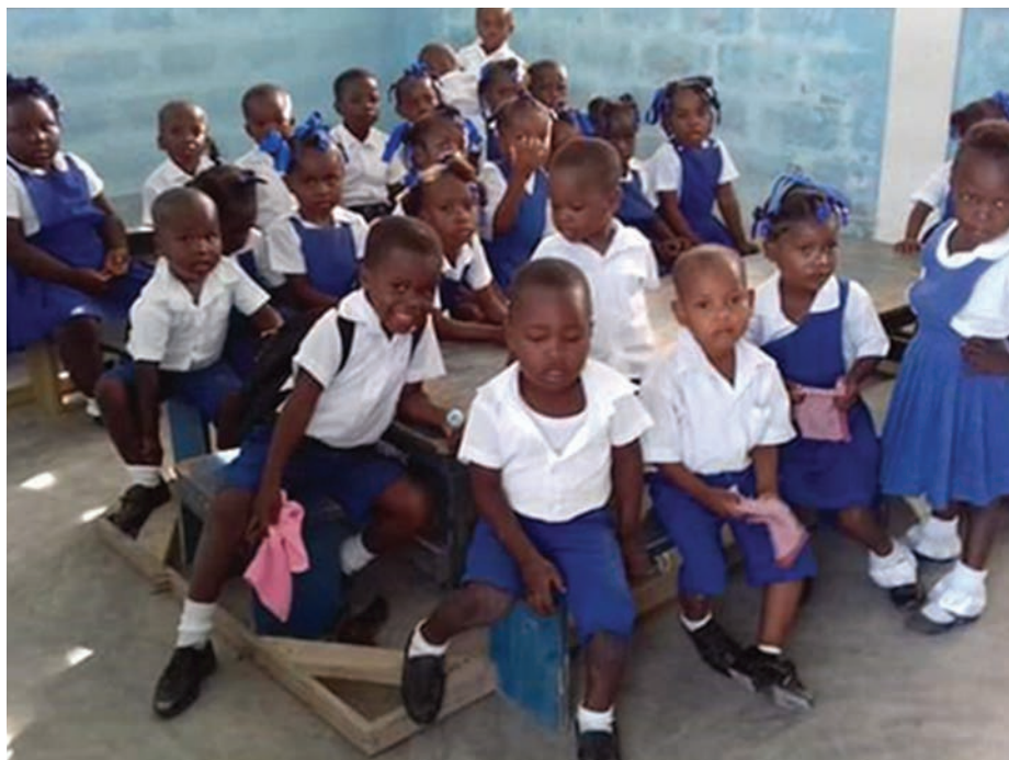
Second-graders at the Bayonnais school.