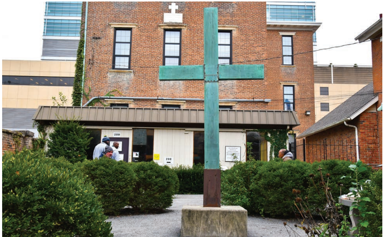
A cross stands at the entrance of St. Lawrence Haven, the former Holy Cross School in Columbus, where the St. Vincent de Paul Society has been serving lunch every weekday (except holidays) for more than 60 years.

Funds to start the program were provided through a large anonymous donation and other small gifts, and have been deposited in five credit unions. Those institutions, and the counties in which they are providing loans to microloan applicants, are: Columbus Metro Federal Credit Union, Franklin; Columbus Municipal Employees FCU, Fairfield and Delaware; TrueCore FCU, Licking; Chivah FCU, Ross; and CES FCU, Knox.