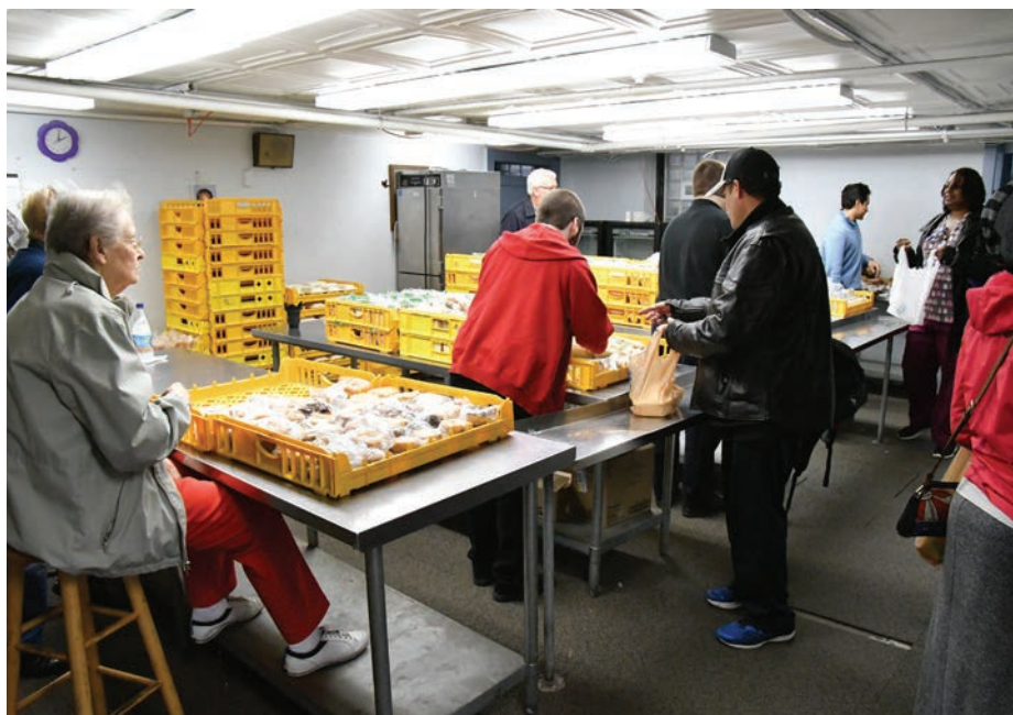
Volunteers prepare meals at the St. Vincent de Paul Society’s St. Lawrence Haven in downtown Columbus, which provides 300 to 500 people daily with weekday lunches.

“What limits us most is funding,” he added. “It costs $10,000 for each