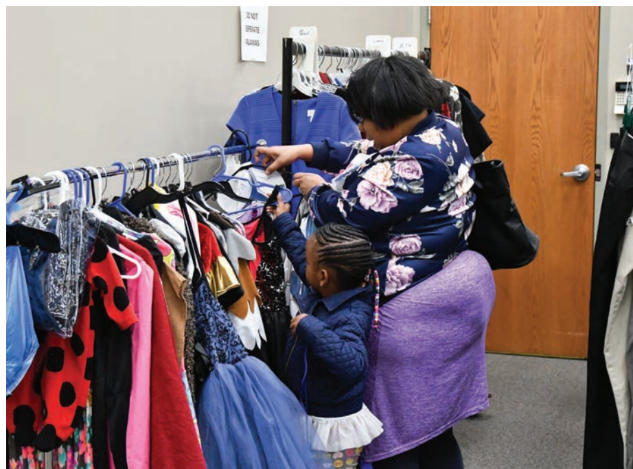
The St. Vincent de Paul Society Clothing Center at the Joint Organization for Inner-City Needs building, located at 578 E. Main St. in Columbus, provided assistance to 7,800 people last year. It’s open four days a week for people who need clothing.