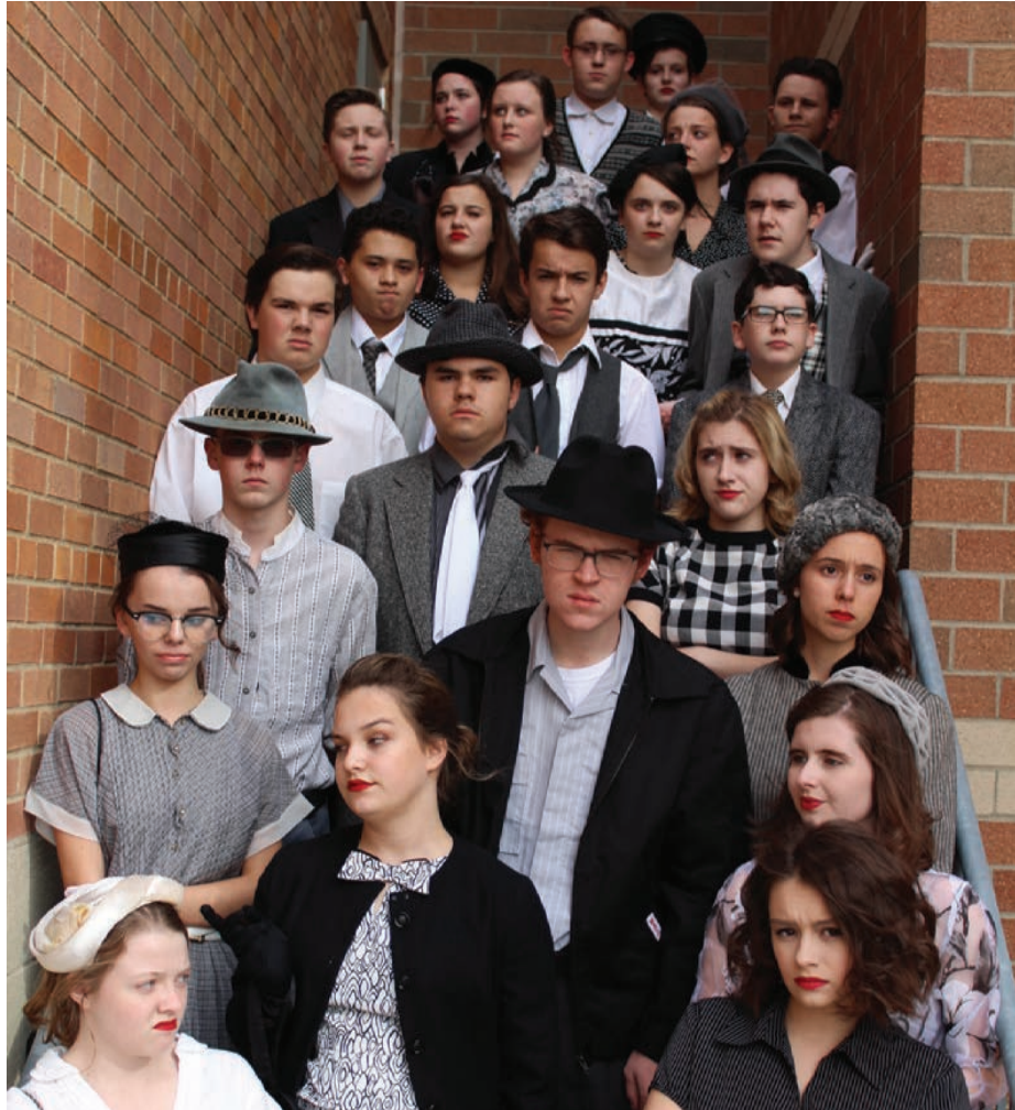
The casts of "12 Angry Men" and "12 Angry Women."