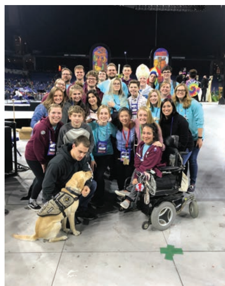
Young people from Sunbury St. John Neumann Church at the National Catholic Youth Conference in Indianapolis.

“At the end of the Mass, the archbishop started asking the youths a few questions about their conference experience and invited them to give gratitude to various groups responsible for