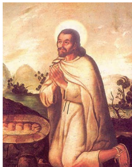
St. Juan Diego