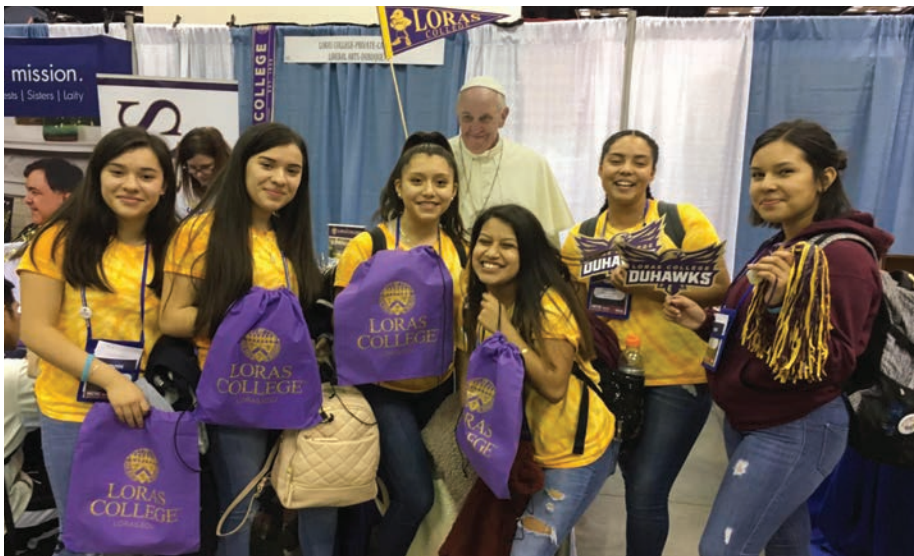
Members of the Columbus St. Thomas Church youth group at a booth sponsored by Loras College in Dubuque, Iowa during the National Catholic Youth Conference last month in Indianapolis. About 20,000 young people from across the nation attended.