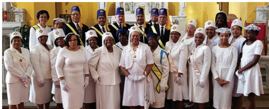
The St. Cyprian Council of the Knights of Peter Claver, Court 298 of its Ladies Auxiliary, and its local Junior Daughters group celebrated the order’s Founders Day at Columbus St. Dominic Church. Members of all three groups are pictured. The order is the nation’s largest African American lay Catholic organization and was founded in November 1909 by four priests and three laymen in Mobile, Alabama. It is named for St. Peter Claver, a Spanish Jesuit priest who ministered to African slaves in what is now the nation of Colombia.