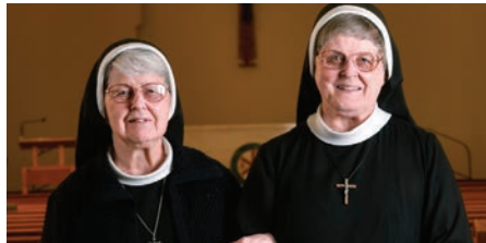
The weekend of Dec. 7-8 is the annual collection for the Retirement Fund for Religious.

Visit retiredreligious.org to learn more.