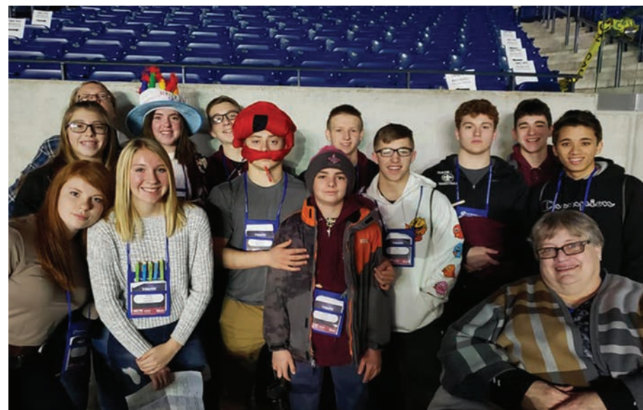
Students representing the five Tuscarawas County parishes – Dover St. Joseph, New Philadelphia Sacred Heart, Dennison Immaculate Conception, Newcomerstown St. Francis de Sales and Zoar Holy Trinity – at the National Catholic Youth Conference.