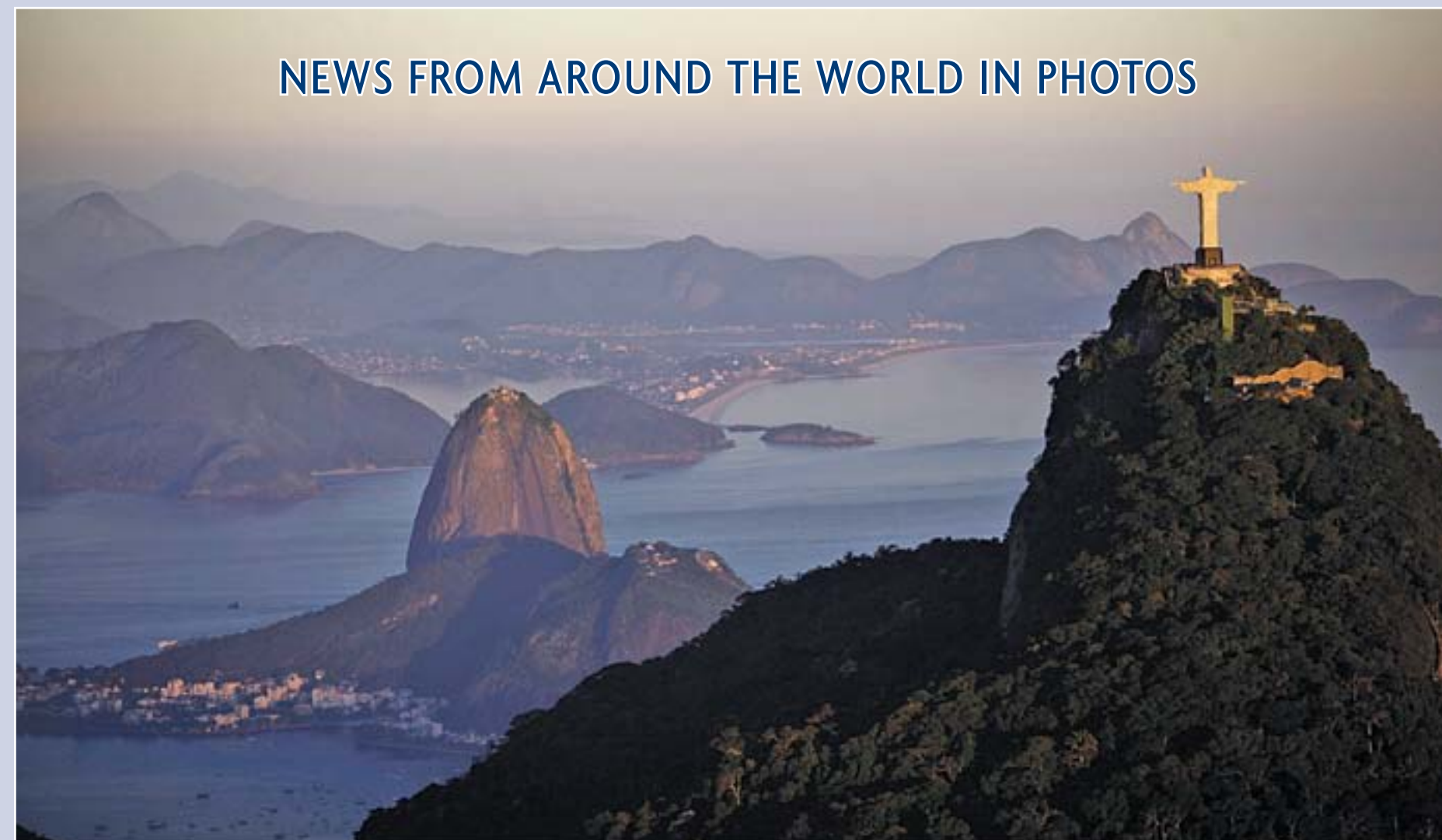
The Christ the Redeemer statue is seen atop Corcovado Mountain in Rio de Janeiro on Feb. 7. World Youth Day will be held in Rio from July 23 to 28, 2013