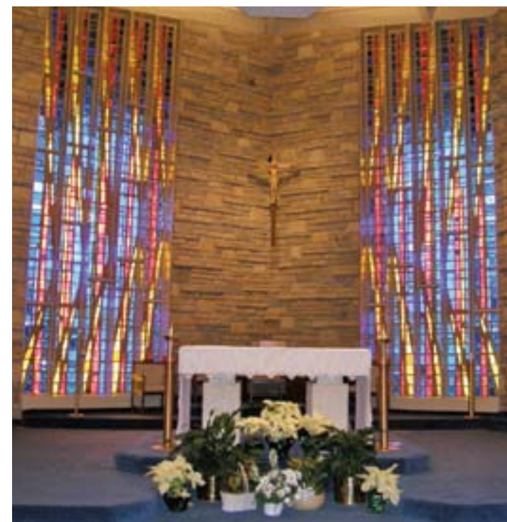
The altar at the Church of Our Lady of the Miraculous Medal, dedicated in 1971. The building also includes a social hall and a rectory