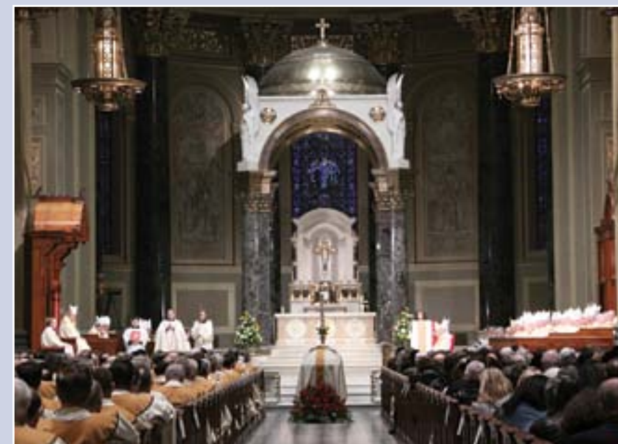
The casket of Cardinal Anthony J. Bevilacqua is seen during his funeral Mass at the Cathedral Basilica of SS. Peter and Paul in Philadelphia on Feb. 7. Cardinal Bevilacqua, who led the Archdiocese of Philadelphia from February 1988 to October 2003, died on Jan. 31