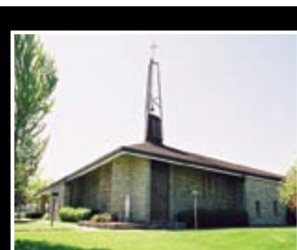
Front Page photo: