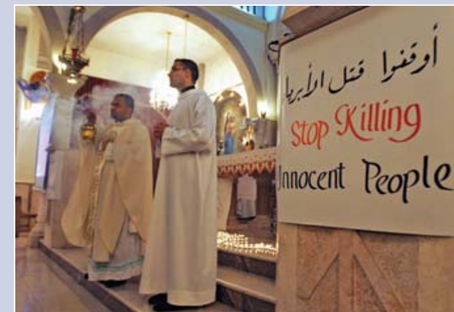
A sign in response to the violence in Syria is seen during a Feb. 11 Mass at a church in the West Bank town of Ramallah. As a sectarian conflict in Syria intensified, Pope Benedict XVI called on all Syrians to begin a process of dialogue and reminded the government of its duty to recognize its citizens' legitimate demands