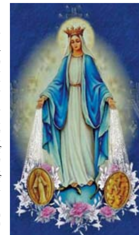
An artist's depiction of the Virgin Mary, with light streaming from her hands as shown on the Miraculous Medal, displayed at her feet

St. Catharine never revealed publicly that she had received the medal until shortly before her death in 1877. The chapel in which she experienced her visions is located at the motherhouse of the Daughters of Charity in Paris. The incorrupt bodies of St. Catharine and St. Louise de Marillac, a co-founder of the Daughters of Charity, are interred there in glass coffins.