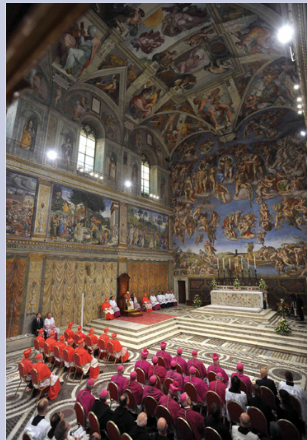
Pope Benedict XVI leads a prayer service in the Sistine Chapel at the Vatican on Oct. 31. The service marked the 500th anniversary of the prayer service led by Pope Julius II in 1512 to celebrate Michelangelo's completion of the ceiling paintings.