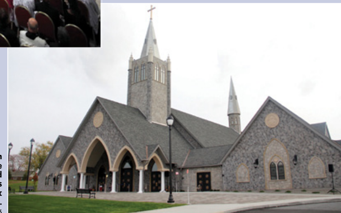
An exterior view of of Blessed Teresa of Calcutta Church in Limerick Township, Pa., is seen on Oct. 27, the same day Philadelphia Archbishop Charles J. Chaput dedicated the 22,000-square-foot Gothic edifice. The church contains artistic and architectural elements of five closed Catholic churches and a Catholic hospital.