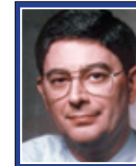
THE CATHOLIC DIFFERENCE George Weigel