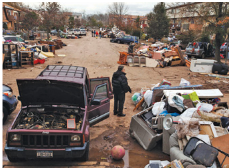
A man stands next to a damaged vehicle as he surveys flood-damaged personal property thrown into the streets on Staten Island in New York City. The costs of recovery efforts after the widespread devastation and destruction caused by the superstorm could be among the highest for any disaster in U.S. history.