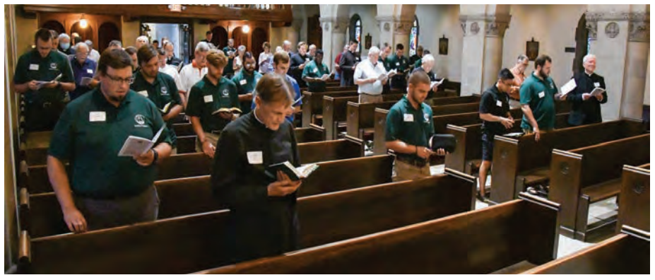
Diocesan priests, seminarians and Columbus Serra Club members gather for prayers in the chapel at Columbus St. Charles Preparatory School during the annual gathering sponsored by the Serrans.