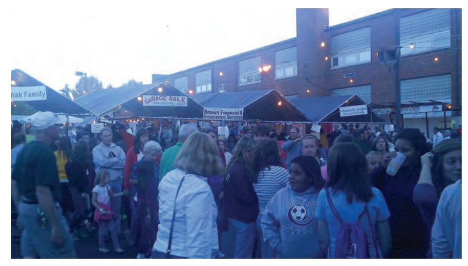
The Worthington St. Michael Labor Day weekend festival has annually attracted crowds from throughout the area since its inception in 1976. This year's festival begins Friday, Sept. 3 and ends Sunday, Sept. 5.

Parish Council all figured out a way to adjust and continue to meet through Zoom or gatherings at sites outside the parish grounds.