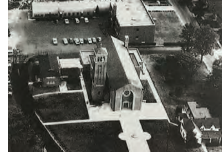
St. Michael Church is pictured in an aerial view during its early years.