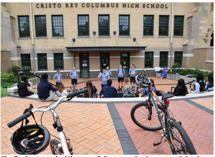
The final stop on the bike tour of diocesan schools came at Columbus Cristo Rey High School, where the seminarians spoke with students.