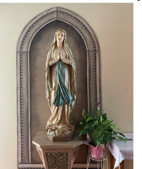
Waverly St. Mary statue of Our Lady

There, in an ornate holder mounted just beneath the statue of the Blessed Mother, burns a solitary blue votive candle. I had never seen this before, and the message that spoke to my heart is this: "I am here, who is your Mother." Just as the tabernacle lamp tells us that Jesus is present, this flame provides the gentle reassurance that Mary is here, too. And she always points us to her son.