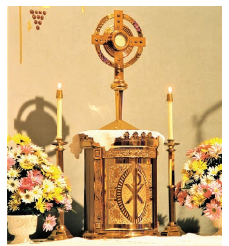
Blessed Sacrament in the monstrance at New Philadelphia Sacred Heart Church. File photo