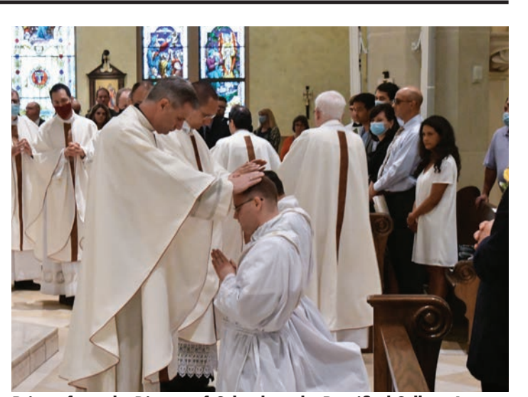
Priests from the Diocese of Columbus, the Pontifical College Josephinum and the Archdiocese of Boston lay their hands on the new priests as part of the Rite of Ordination.

us in prayer through livestreaming, I have seen how you bring Jesus over and over again. I know your goodness. I witness your generosity, your humility, your genuine concern for God's people. I know your love for God.