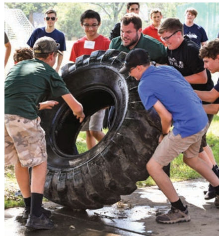
Tire flipping was one of the outdoor activities during the opening day of the Quo Vadis retreat on Sunday, July 25 at the Josephinum.