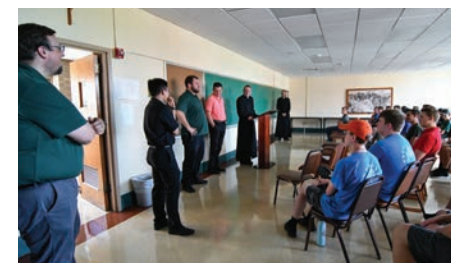
Seminarians speak with approximately 40 participants in the Quo Vadis retreat.

servicing has on formation of young Catholics, Westerville St. Paul Church started a Knights of the Holy Temple group for male servers modeled after a program founded in the Diocese of Lafayette, Indiana. Approximately 80% of Lafayette's seminarians come out of these Knights' groups. Another Columbus diocesan parish is planning to launch a chapter this fall.