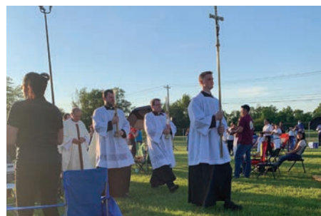
Seminarians lead a procession for an outdoor Mass.

Weekday afternoons and evenings were spent in what Colby described as “a grab bag of activities.” Tuesday afternoons were devoted to what he called “odds and ends,” with Tuesday