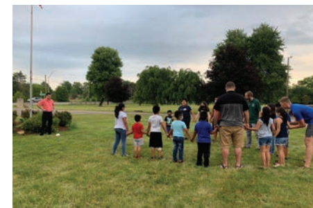
Seminarians join the children for a game.