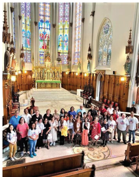
Pilgrims from the Diocese of Columbus visited the St. Joseph Shrine church in Detroit.