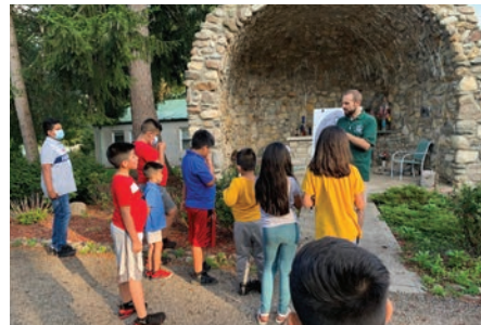
Children gather for prayer during a Kids' Club program.

The Mexican-based sisters' efforts in those parishes and elsewhere center on door-to-door evangelization. During home visits, they encourage inactive Catholics to return to the Church and nonreligious people to examine Catholic teaching.