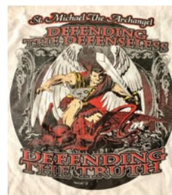
St. Michael shirt design

us in battle. Be our protection against the wickedness and snares of the devil. May God rebuke him, we humbly pray. And do thou, O Prince of the Heavenly Host, by the power of God, thrust into hell