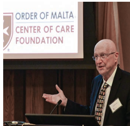
Catholic author Peter Kreeft speaks at the Order of Malta's Hospitaller Dinner on Friday, Sept. 17 at the Pontifical College Josephinum.

mother can murder her own baby, what's left of western civilization to save," Kreeft pointed out. "And maybe the most single disastrous symptom of all is that Mother Teresa's foundational common sense sounds shocking to most of us.