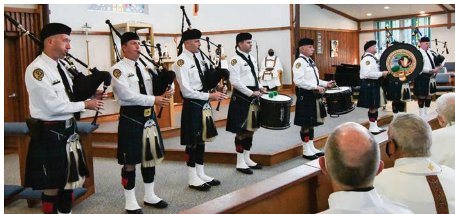
Members of the Columbus Police and Fire Pipes and Drums play Amazing Grace at the end of the Blue Mass on Friday, Sept. 10 at St. Timothy Church.

courage. Think of the courage that must have been mustered when being asked to take on this role in the midst of so much confusion.