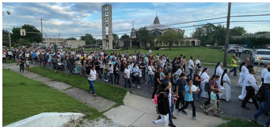
A Eucharistic procession on the Solemnity of the Assumption of the Blessed Virgin Mary leaves Columbus Christ the King Church on Sunday, Aug. 15. The east-side parish is celebrating its 75th anniversary in 2021.

The demographics of the neighborhood surrounding the Christ the King