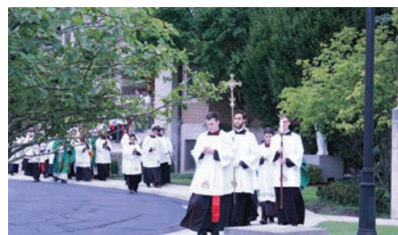
Seminarians lead a Eucharistic procession outside the Pontifical College Josephinum at the start of the new academic year.