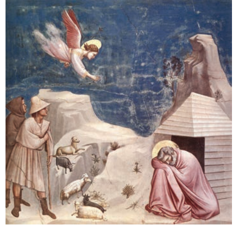
The Dream of Joachim fresco by Giotto.

A blogger recently suggested that this phenomenon is likely to evolve this year as parents look for ways to make up for the disappointments of last Christmas. The church, however, has given us the opportunity to make July 25 special in an entirely new way as we celebrate the first-ever World Day of Grandparents and the Elderly precisely on that day.