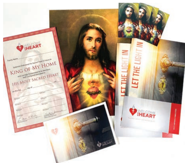
Items in the in-home Sacred Heart enthronement kit available at www.welcomehisheart.com .

The "Welcome His Heart" print package includes two enthronement booklets, one hardback Sacred Heart image for framing, four prayer cards to the Sacred Heart, a welcome letter and a certificate of