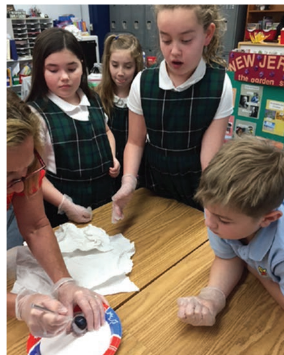
Columbus St. Agatha School fourth-grade students have been studying all about eyes, the parts of the eye and eye care. They wrapped up the lesson by dissecting cow eyes.