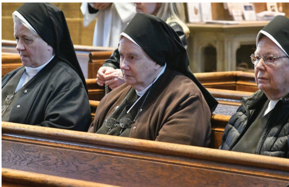
Above: Three members of the Carmelite Sisters for the Aged and Infirm, who have been serving the sick and the elderly at Mother Angeline McCrory Manor, the Villas at St. Therese and the diocesan institutions which preceded it since 1948.