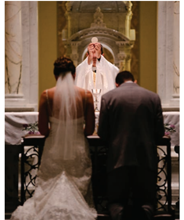
A couple's wedding day and the Sacrament of Matrimony are the start of their marriage story.