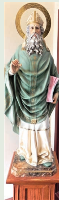
A statue of St. Patrick greets visitors in the entryway at Columbus St. Patrick Church.

In his Confessions , Patrick wrote, “For as every day arrives, I expect either sudden death or deception or being taken back as a slave, or