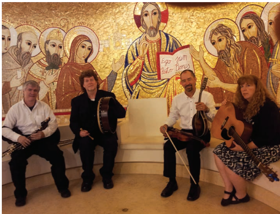
The Kells band provides traditional Irish music at a celebration in the parish hall at Columbus St. Patrick Church following a solemn Mass and procession on the eve of St. Patrick's Day.