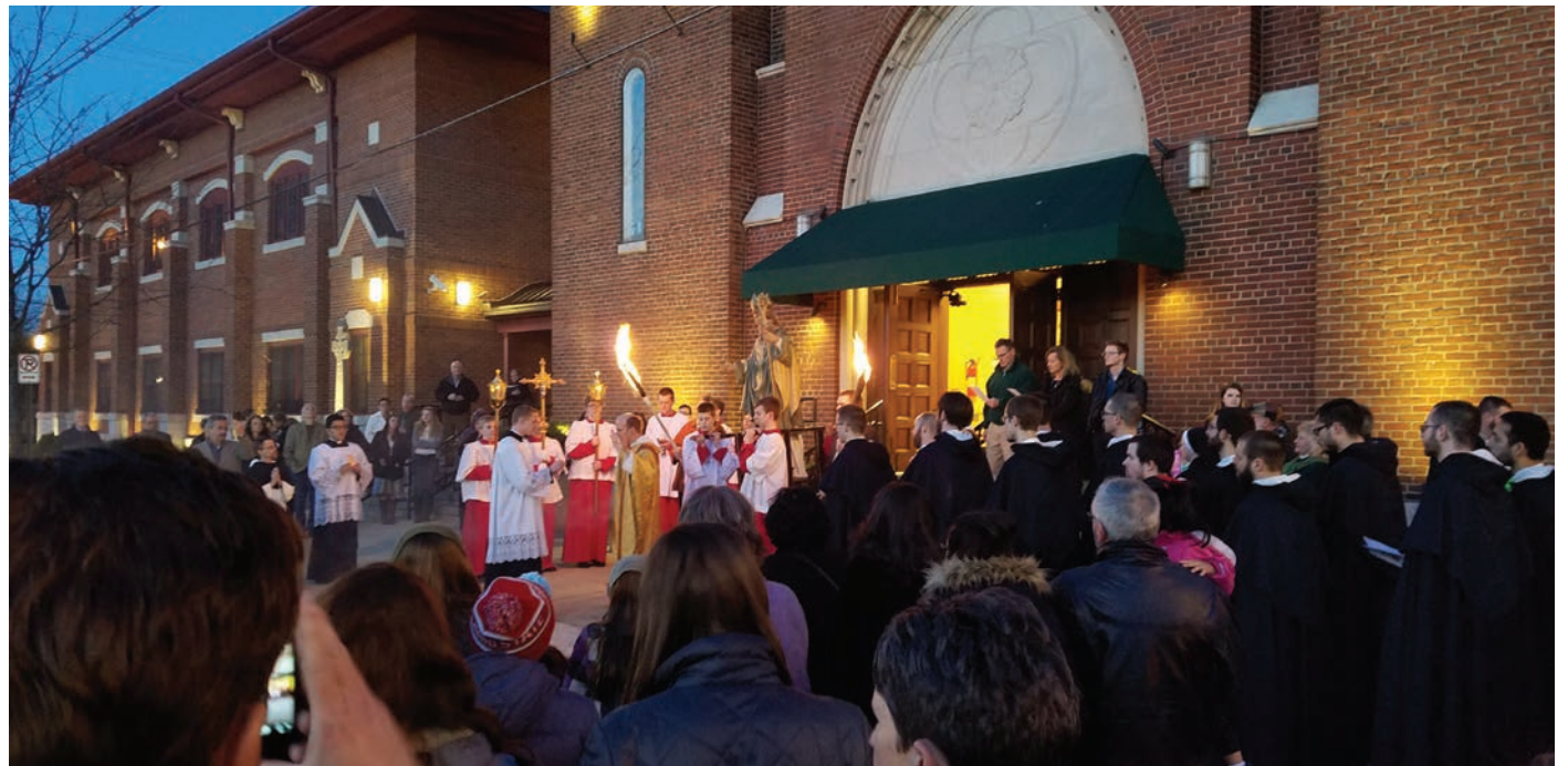
Columbus St. Patrick Church's annual parish celebration of its patron on the vigil of St. Patrick's Day features a torchlight procession and a statue of the saint that is carried around the parish.

The day continues at 1 p.m. with a guided tour of the church and a tea reception. At 3 p.m., a Divine Mercy chaplet will be recited, and