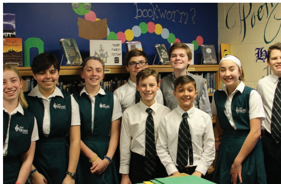
Students and staff from Worthington St. Michael School attended the March for Life (above) on Jan. 24 in Washington to put the virtue of patriotism into action by defending the lives of the unborn. At an open house on Jan. 31 during Catholic Schools Week, students (below) led tours of the school for families.