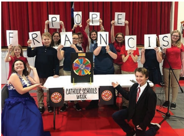
Coshocton Sacred Heart School students played Wheel of Fortune with Catholic-themed clues as part of Catholic Schools Week, complete with their own Pat Sajak and Vanna White.