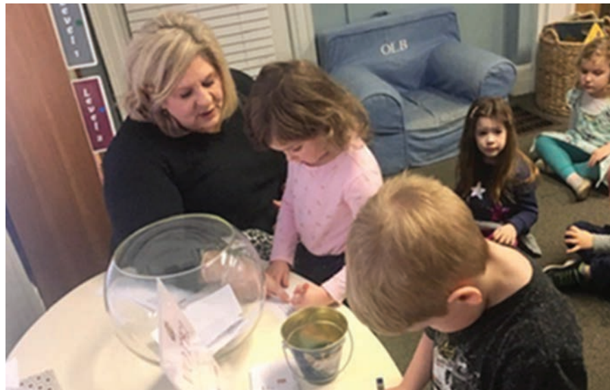
Columbus Our Lady of Bethlehem School and Childcare students went to the polls as part of Celebrate Your Nation Day. Students from toddlers through kindergarten learned about voting, its importance in allowing everyone to voice his or her opinion, and respecting the majority decision. Students voted on whether they wanted to wear wacky clothes or pajamas to school, with the majority favoring a pajama day.