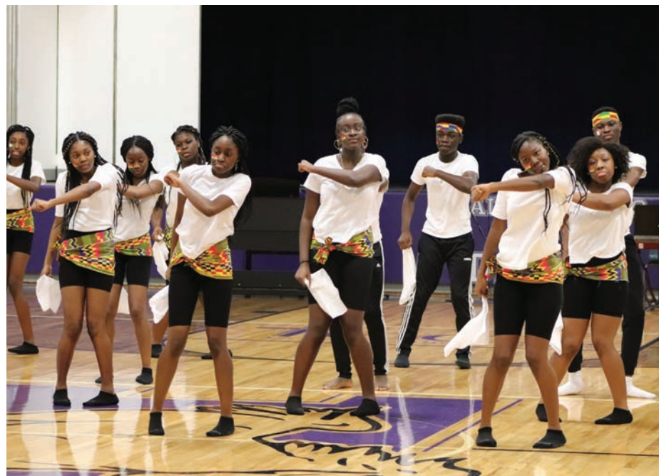
Students at Columbus St. Francis DeSales High School organized a World Cultures Week to celebrate the diverse cultures represented among the student body. The week ended with an assembly in which students participated in performances of traditional African dance, songs, poetry, Irish dancing and bagpipe music and put on an ethnic fashion show.