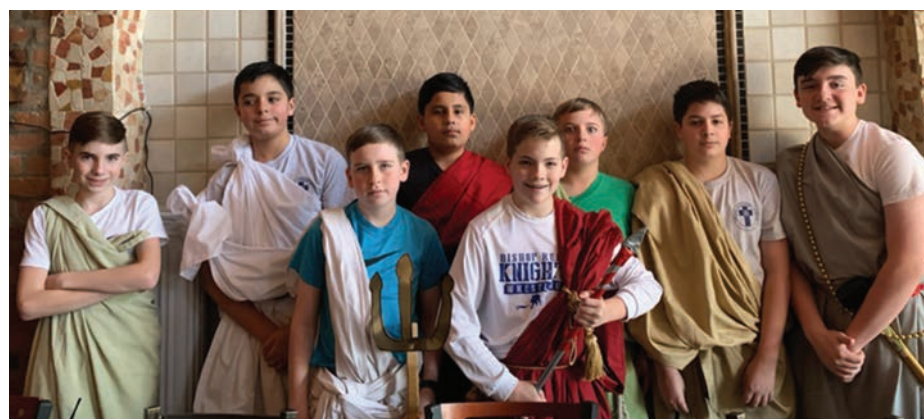
Columbus Trinity Elementary School seventh-grade students completed a unit on mythology by dressing like residents of ancient Greece and enjoying a Greek luncheon.