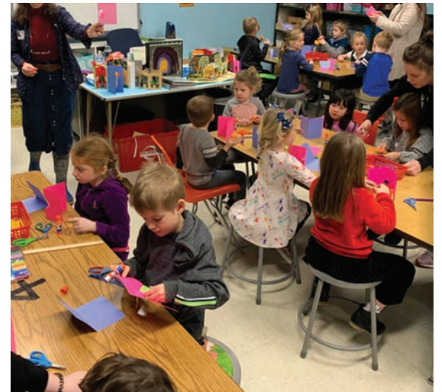
Students at Columbus St. Agatha School enjoyed an all-art day that included magicians, balloon art and a hedgehog. Pre-kindergarten and kindergarten students are shown exercising their creativity.