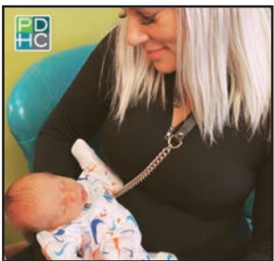
Saving lives at PDHC: Babies are being saved at Pregnancy Decision Health Centers, which received a record number of visits at its clinics in Columbus and Lancaster in 2021 as well as an all-time high in calls, texts and chats as PDHC began to offer the abortion pill reversal, Page 6