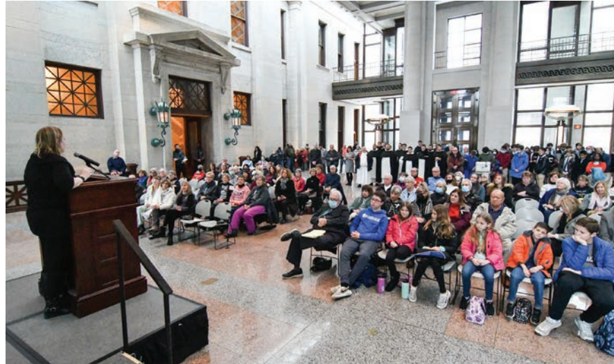
A crowd of approximately 400 people packed into the Atrium at the Ohio Statehouse on Monday, Jan. 24 for the annual Roe Remembrance to listen to speakers who expressed optimism that Roe v. Wade, the 1973 U.S. Supreme Court ruling on abortion, will soon be overturned.