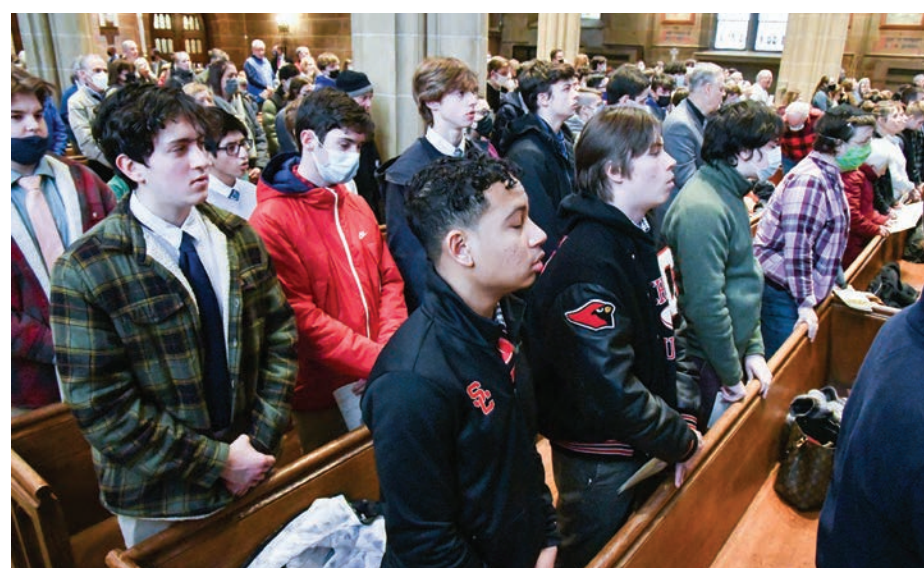
Students from Columbus St. Charles Preparatory School were among the faithful attending the Respect Life Mass on Monday, Jan. 24 at St. Joseph Cathedral.