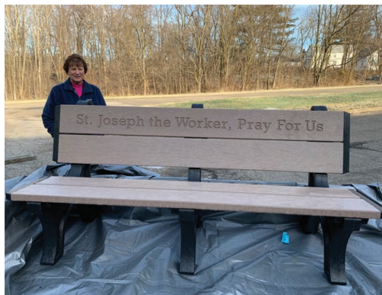
Pictured is one of 10 benches made from recycled material that will be included in a rosary garden at Plain City St. Joseph Church.