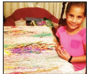
Mission work in Belize: A child is pictured with rosaries made by a former Columbus resident and others to be used in Belize, where an effort is underway to raise money to complete a church near the remote village of San Pablo, Page 11