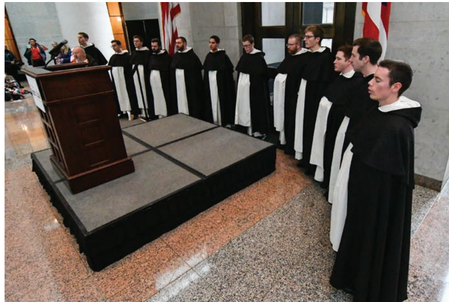
Dominican novices from St. Gertrude Priory in Cincinnati ended the rally as they have the past several years with the singing of the Marian hymn Salve Regina (Hail, Holy Queen).

cause of the work done by the pro-life community, "most especially the persistent and loving witness of pro-life and pro-love missionaries on the sidewalks outside of central Ohio abortion clinics."