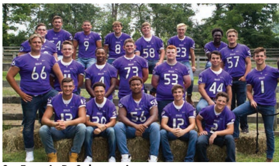
St. Francis DeSales seniors.

DeSales hopes to make that just a one-year absence and keep playing well into November this year. But, as always, its schedule isn't for the meek and humble of heart. It includes