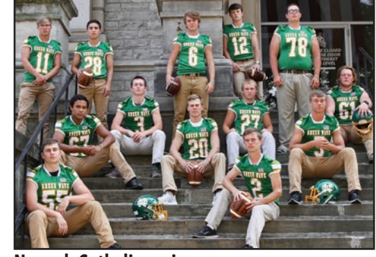
Newark Catholic seniors.

He inherits a Newark Catholic team that finished an uncharacteristic 3-7 a year ago and missed the playoffs. The Green Wave want to change those results in 2018 and build upon a proud tradition that includes 35 postseason