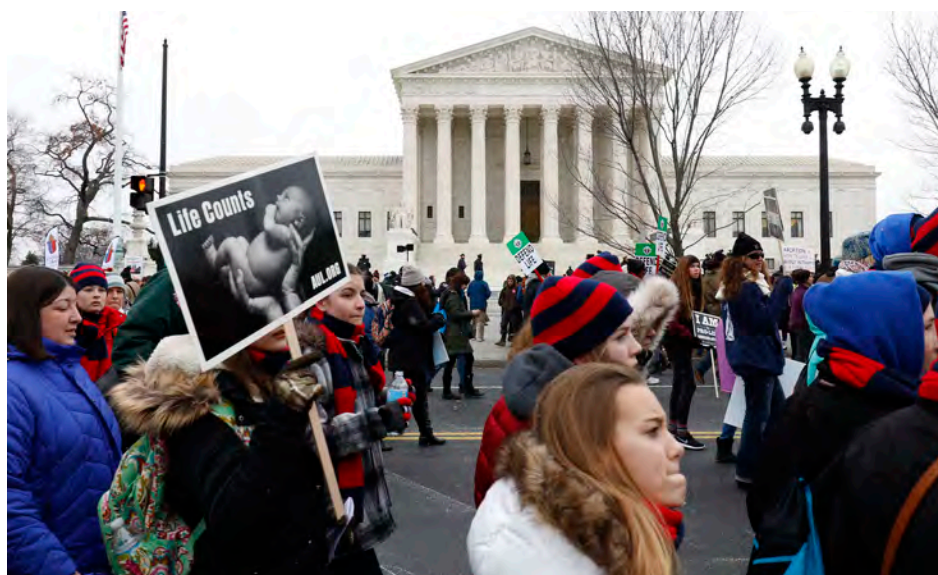
Pro-life advocates walk past the U.S. Supreme Court building during the March for Life in Washington on Jan. 22, 2016. This year's march is set for Friday, Jan. 27, starting near the Washington Monument.

So if the sponsoring organization is counting on registration fees, "they won't have enough in time, and will have