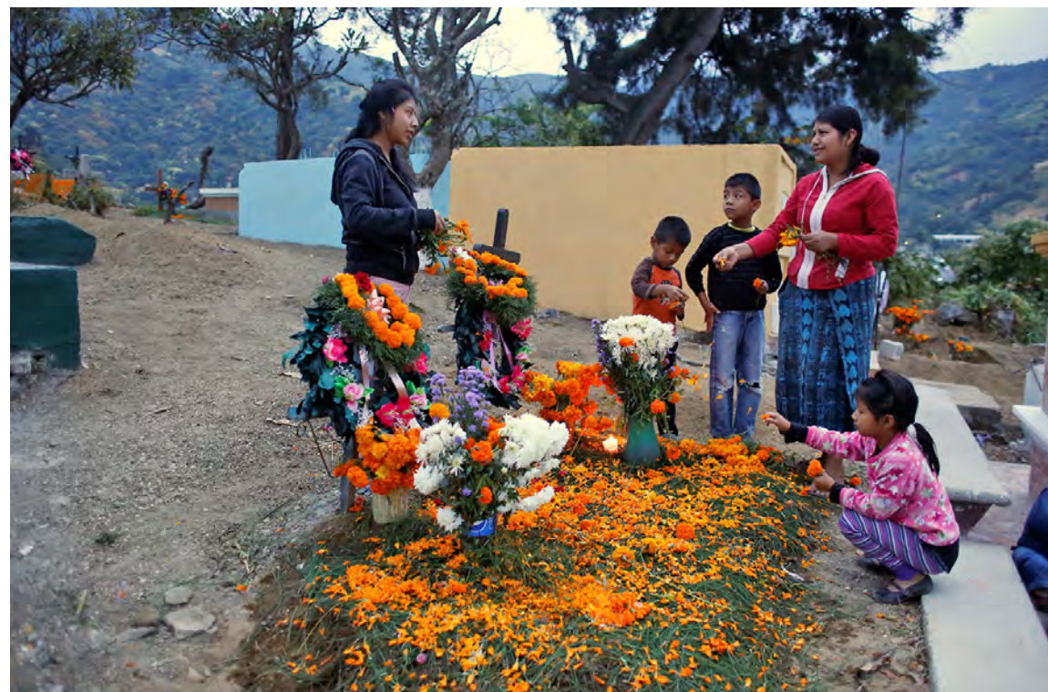
Left: A family spreads flower petals on the tomb of their loved one on All Saints Day, Nov. 1, 2016, at a cemetery in Sacatepequez, Guatemala.

He said that as saints have done throughout the ages, Christ’s followers today are called “to confront the troubles and anxieties of our age with the spirit and love of Jesus.”