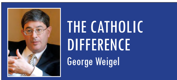
THE CATHOLIC DIFFERENCE George Weigel

There were, in short, multiple Reformations. Their sometimes-violent interaction created much of what