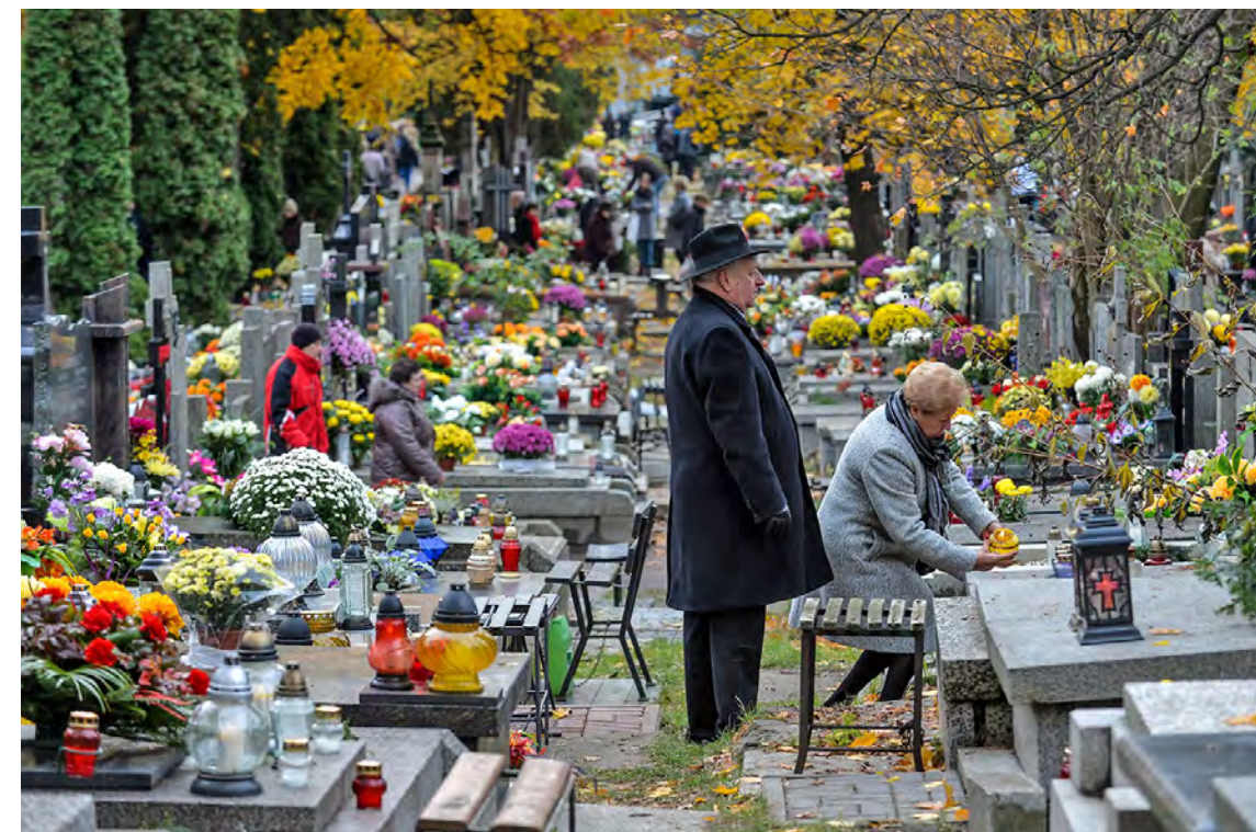
Right: A woman lights a candle at the tombstone of a relative on Nov. 1, 2016, All Saints Day, at the Wola Cemetery in Warsaw, Poland.

“Many seem to have a great hatred of remembering and celebrating the lives of great Christian men and women, yet have no problem fervently celebrating the lives of secular heroes like George Washington,” says the Web site www.churchyear.net . “All Saints Day is simply a day to celebrate the lives of all the great heroes of the Christian faith.”