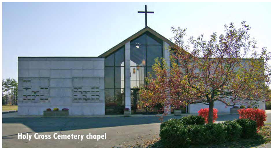
Holy Cross Cemetery chapel