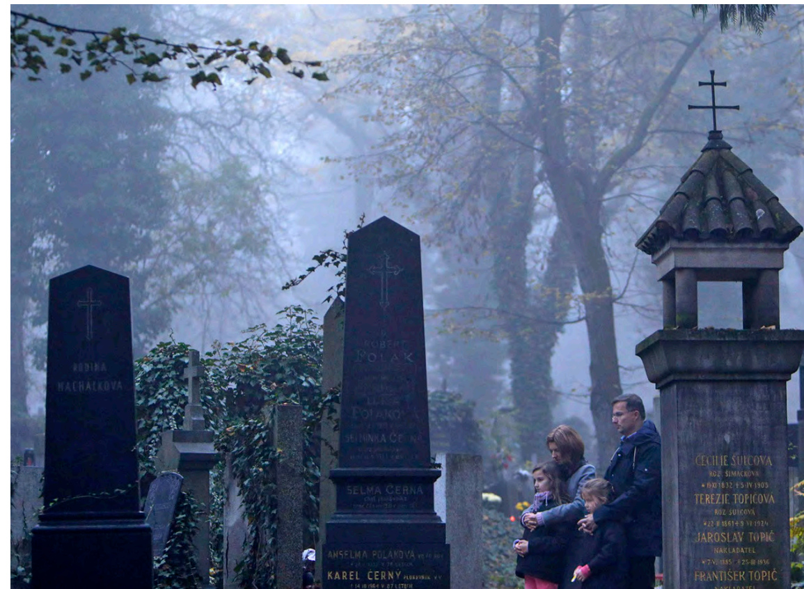
Left: A man prays in front of a grave at sunset in Vienna, Austria. Catholics mark All Saints Day by visiting the cemeteries and graves of deceased relatives and friends.