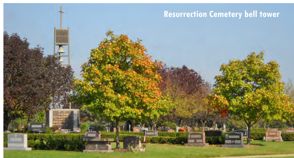
Resurrection Cemetery bell tower