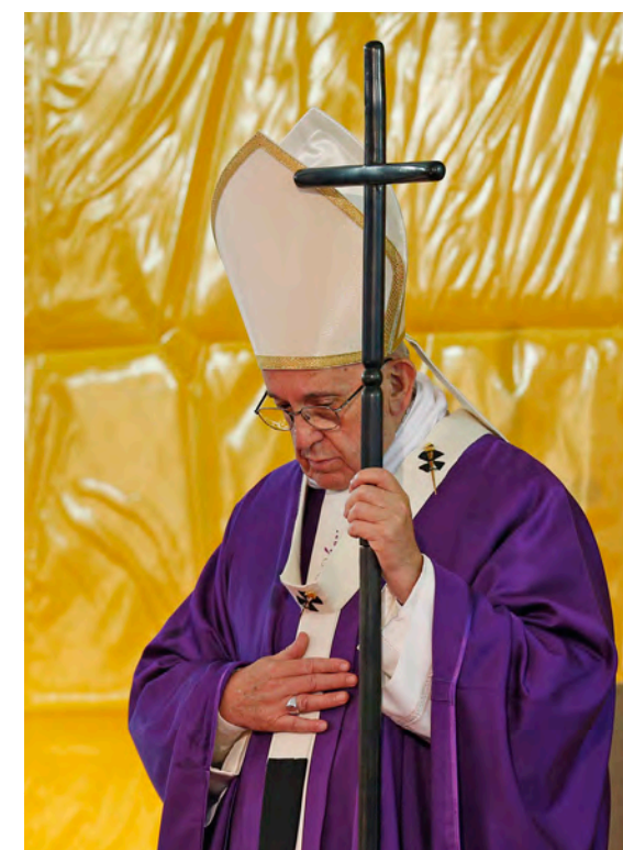
Pope Francis holds his pastoral staff as he celebrates Mass in Rome’s Prima Porta Cemetery on Nov. 2, 2016, All Souls Day.

Pope Boniface IV changed the date for the feast to May 13 in the year 610. On that day, he dedicated a church at the site of the ancient Roman Pantheon, which had been built as a temple to “all gods.”