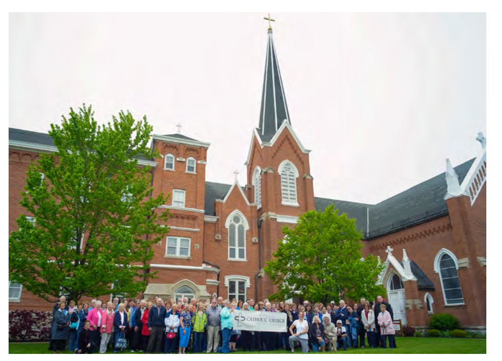
Tour group of about 100 people in front of Shrine of the Holy Relics.