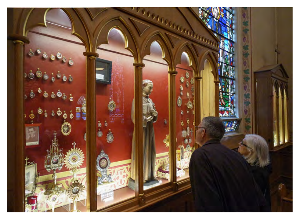
Photos, top of page and above: Relic chapel at Shrine of the Holy Relics at Maria Stein.

The shrine is open to visitors from 9:30 a.m. to 6 p.m. Monday through Thursday, from 9:30 a.m. to 4 p.m. Friday and Saturday, and from noon to 4 p.m. Sunday. It is closed on major holidays