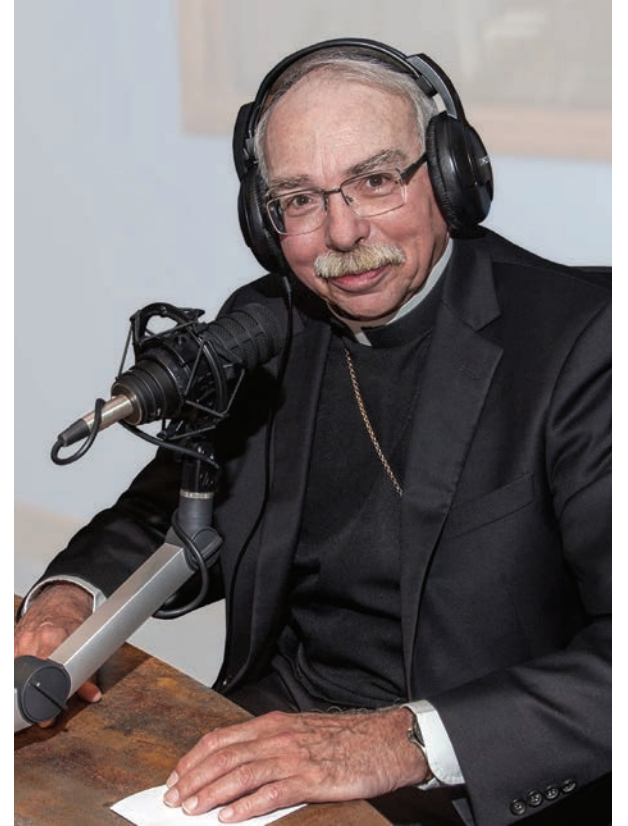
See BISHOP, Page 4 Bishop Frederick Campbell.

The plan, among other things, calls for an apostolic visitation by Vatican officials and for creation of a national commission of laypersons with independent authority to investigate all aspects