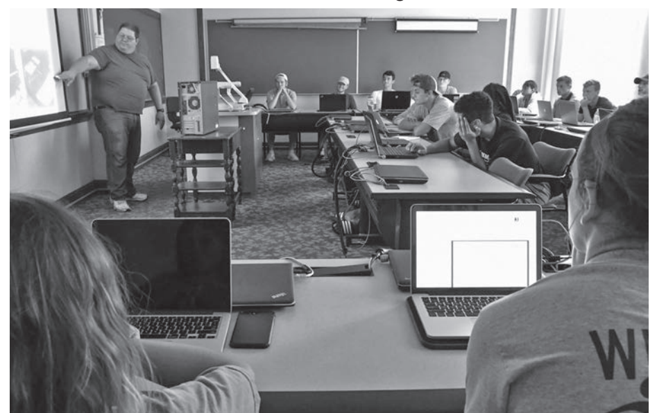
A classroom at Ohio Dominican University, which recently was reaccredited by the Higher Learning Commission for the maximum 10 years allowable.

the institution's operations; the institution acts with integrity and its conduct is ethical and responsible; the institution provides high-quality education, wherever and however its offerings are delivered; the institu-