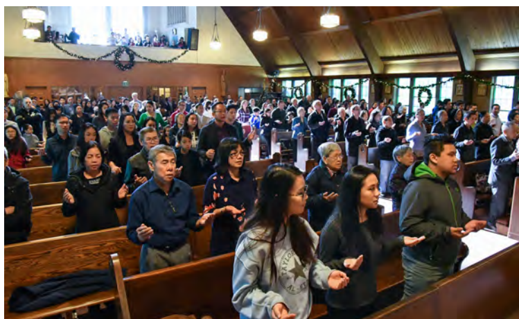
Left: Worshippers at the Vietnamese Sunday Mass at Columbus Ss. Augustine & Gabriel Church. Right: One of the parish's quarterly potluck brunches.

Parish organizations include an outreach committee, a St. Vincent de Paul Society conference, a Knights of Columbus chapter, and a women's club.