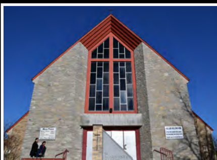
Front Page photo:

Columbus Ss. Augustine & Gabriel Church, located in the Linden area, is a home parish for that neighborhood and for the central Ohio Catholic Vietnamese community.