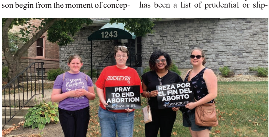
The 40 Days for Life prayer vigil campaign is underway through Nov. 3 at the Founders abortion clinic, 1243 E. Broad St., Columbus, and around the world.

We are also there to pray for the precious unborn children at the hour of their death – children who (like us) were made in the image and likeness of God. We pray also for those who participate in, perform, facilitate and promote abortion. Finally, we pray for each other as we build up the body of Christ and seek to grow in our own faith. While attacks on the human per-