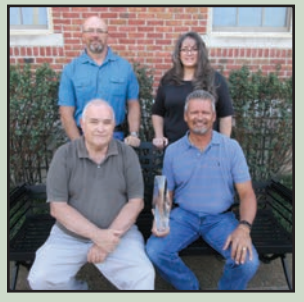
Resourceful: The diocesan Facilities Office is responsible for conserving resources with environmentally conscious initiatives, Page 2