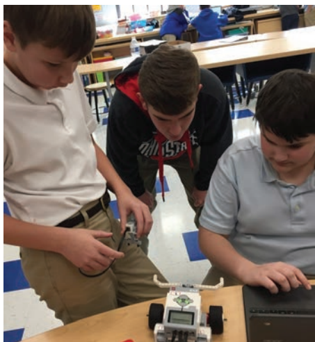
Robotics is incorporated into the STEM program at Westerville St. Paul School.

One eighth-grade student used sewing machines for a "sew loved" project, making pillowcases for the homeless, turbans for cancer patients and knapsacks for the homeless. The student received the Martin Luther King 2018 Fouse Award for her efforts.