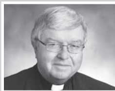
QUESTION & ANSWER Father Kenneth Doyle Catholic News Service

There is no prohibition against using that rite today, although it has largely been replaced in the contemporary church by the Blessing of an Engaged Couple from the church’s Book of Blessings , published in 1989. That newer rite celebrates in prayer a newly engaged couple and asks the Lord to guide them as they prepare for marriage; it can be celebrated by