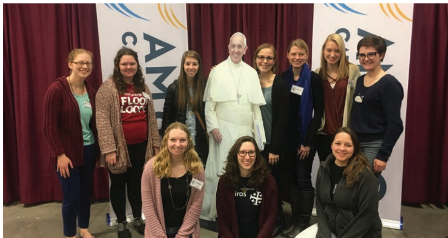
Ohio Northern University Newman Club members pose with a cutout of Pope Francis at the 2018 diocesan Catholic Women's Conference on the state fairgrounds. Members of the club plan to be at this year's conference later this month.