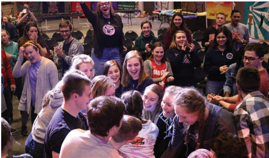
Participants in last spring's Buckeye Awakening, a twice-a-year retreat for college students sponsored by the Columbus St. Thomas More Newman Center, located adjacent to The Ohio State University's main campus. Each of the retreats usually attracts about 175 students from OSU and other nearby colleges.