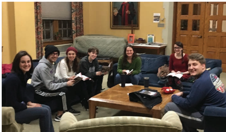
Members of Capital University’s Catholic Student Organization meet at the Kerns Religious Life Center on campus, where they gather on Wednesday nights to pray the rosary, study the coming Sunday’s Scripture readings and have general discussion. The group also sponsors occasional social events.