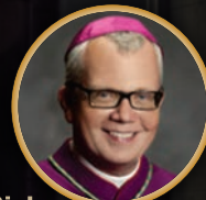
Bishop Donald J. HYING