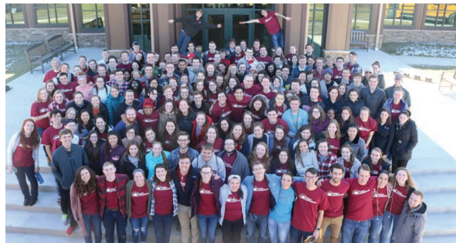
Participants in the spring 2018 Buckeye Awakening retreat for college students, sponsored by the Columbus St. Thomas More Newman Center, gather at the center. This spring's Awakening will be the 20th in the series.

that ended a few years ago when the parish became part of a consortium with Danville St. Luke Church and the now-closed Church of the Nativity in Utica.