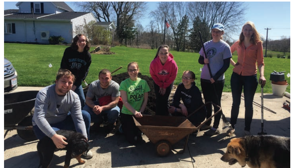
Members of Ohio Northern University's Newman Club for Catholic students take part in a service project, doing yardwork at the home of a family in Ada. The family had the winning raffle ticket at the Ada Our Lady of Lourdes Church bazaar for three hours of service to be performed by the students.