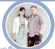
Music By: OUT OF DARKNESS

"I can do all things through Christ who gives me strength."