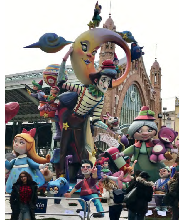
Hundreds of meticulously crafted fallas are displayed throughout the city and burned on March 19