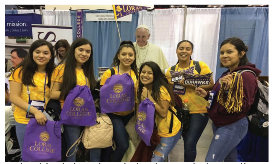
Members of the Columbus St. Thomas Church youth group at a booth sponsored by Loras College in Dubuque, Iowa during the National Catholic Youth Conference last month in Indianapolis. About 20,000 young people from across the nation attended.