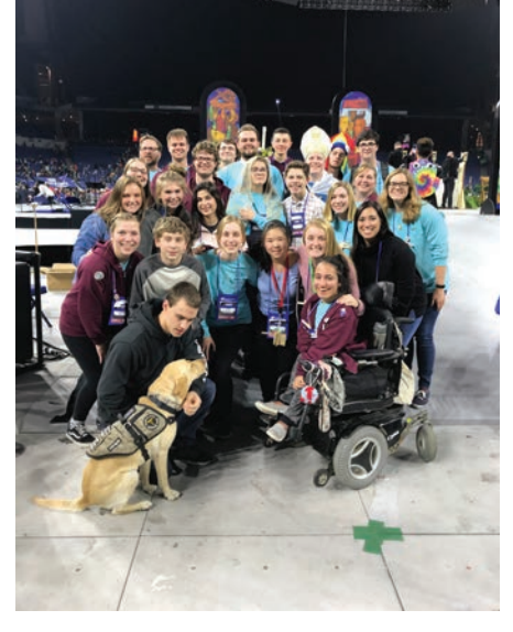
Young people from Sunbury St. John Neumann Church at the National Catholic Youth Conference in Indianapolis.

"At the end of the Mass, the archbishop started asking the youths a few questions about their conference experience and invited them to give gratitude to various groups responsible for