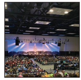
Youth conference: Young Catholics from throughout the diocese traveled to Indianapolis last month for the annual National Catholic Youth Conference, Pages 8-10