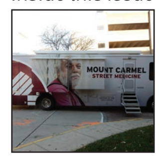
Street medicine: Mount Carmel's street medicine program has rolled out a new mobile coach to serve those in need, Page 3