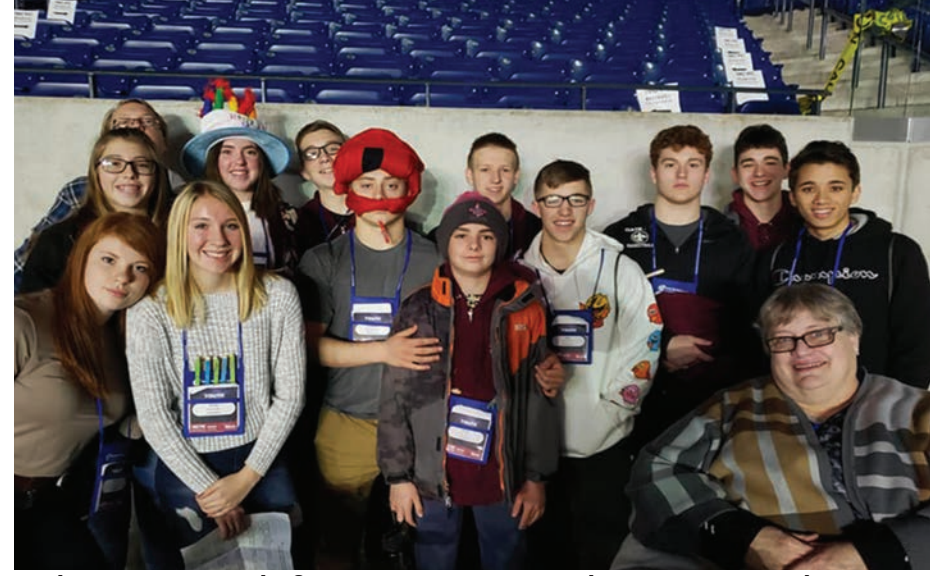
Students representing the five Tuscarawas County parishes -- Dover St. Joseph, New Philadelphia Sacred Heart, Dennison Immaculate Conception, Newcomerstown St. Francis de Sales and Zoar Holy Trinity -- at the National Catholic Youth Conference.