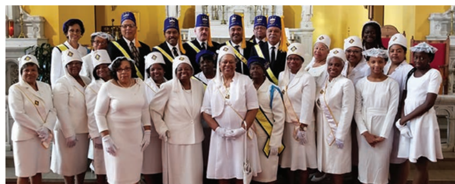
The St. Cyprian Council of the Knights of Peter Claver, Court 298 of its Ladies Auxiliary, and its local Junior Daughters group celebrated the order's Founders Day at Columbus St. Dominic Church. Members of all three groups are pictured. The order is the nation's largest African American lay Catholic organization and was founded in November 1909 by four priests and three laymen in Mobile, Alabama. It is named for St. Peter Claver, a Spanish Jesuit priest who ministered to African slaves in what is now the nation of Colombia.

who, through his daily actions, words and prayers exemplifies the "good and faithful servant." The recipient will have the opportunity to share his personal testimony during the ceremony.