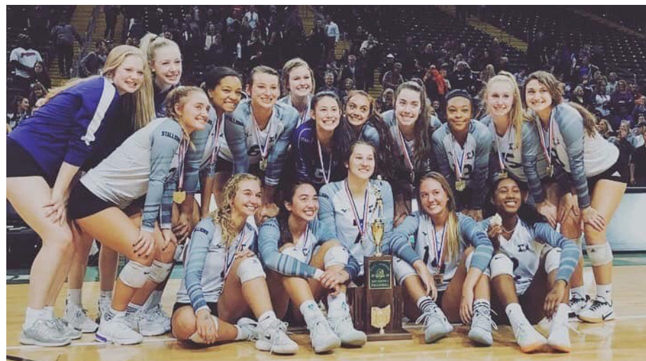
Members of the state champion St. Francis DeSales volleyball team pose with the trophy after winning the Division I title on Saturday, Nov. 9.