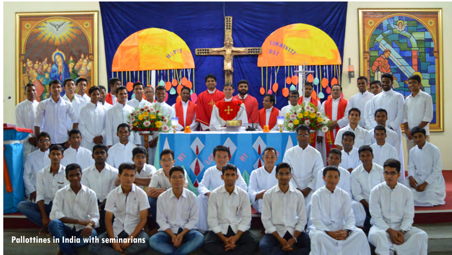
Pallottines in India with seminarians