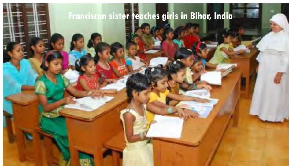
Franciscan sister teaches girls in Bihar, India

The orphans and others served by the mission are trying to become more self-sufficient by making bricks for the new building and by growing many crops and raising cattle, chickens, and other animals for the mission's use. Any surplus products are sold at a farmer's market. The missionaries say they aren't looking for a handout as much as they are for a help-out to keep the mission strong and viable.