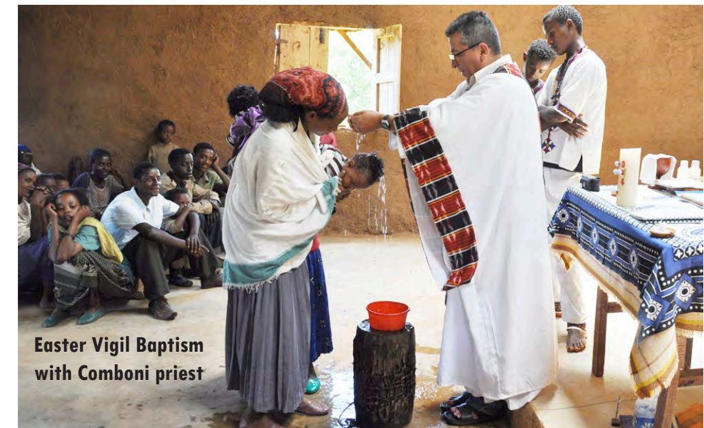
Easter Vigil Baptism with Comboni priest