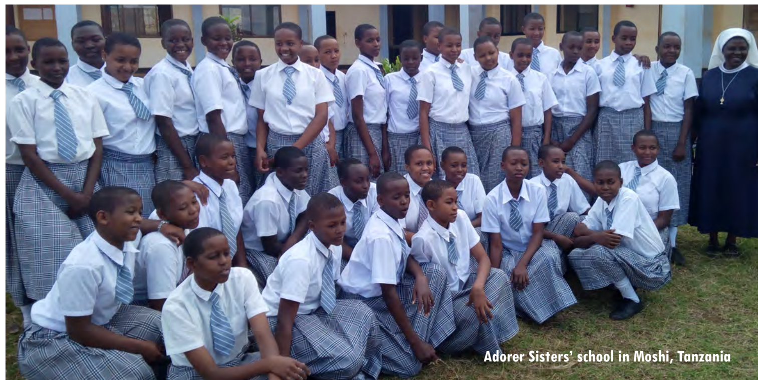
Adorer Sisters' school in Moshi, Tanzania