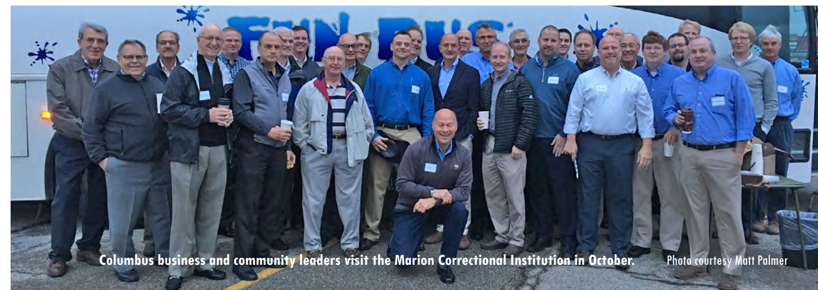
Columbus business and community leaders visit the Marion Correctional Institution in October.

as EMBARK, works with selected prisoners at MCI and the women's prison who are 12 to 18 months away from being released. It assigns them at least two navigators, who are volunteers from the community serving as mentors to the inmates. The navigators and Kindway staff members find jobs and housing for the inmates and stay in touch with them once they are released.