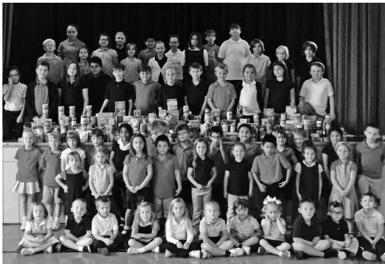
Coshocton Sacred Heart School celebrated Catholic schools Week with a Charity Day on which students brought in items for the local food pantry.