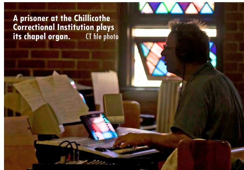
A prisoner at the Chillicothe Correctional Institution plays its chapel organ.