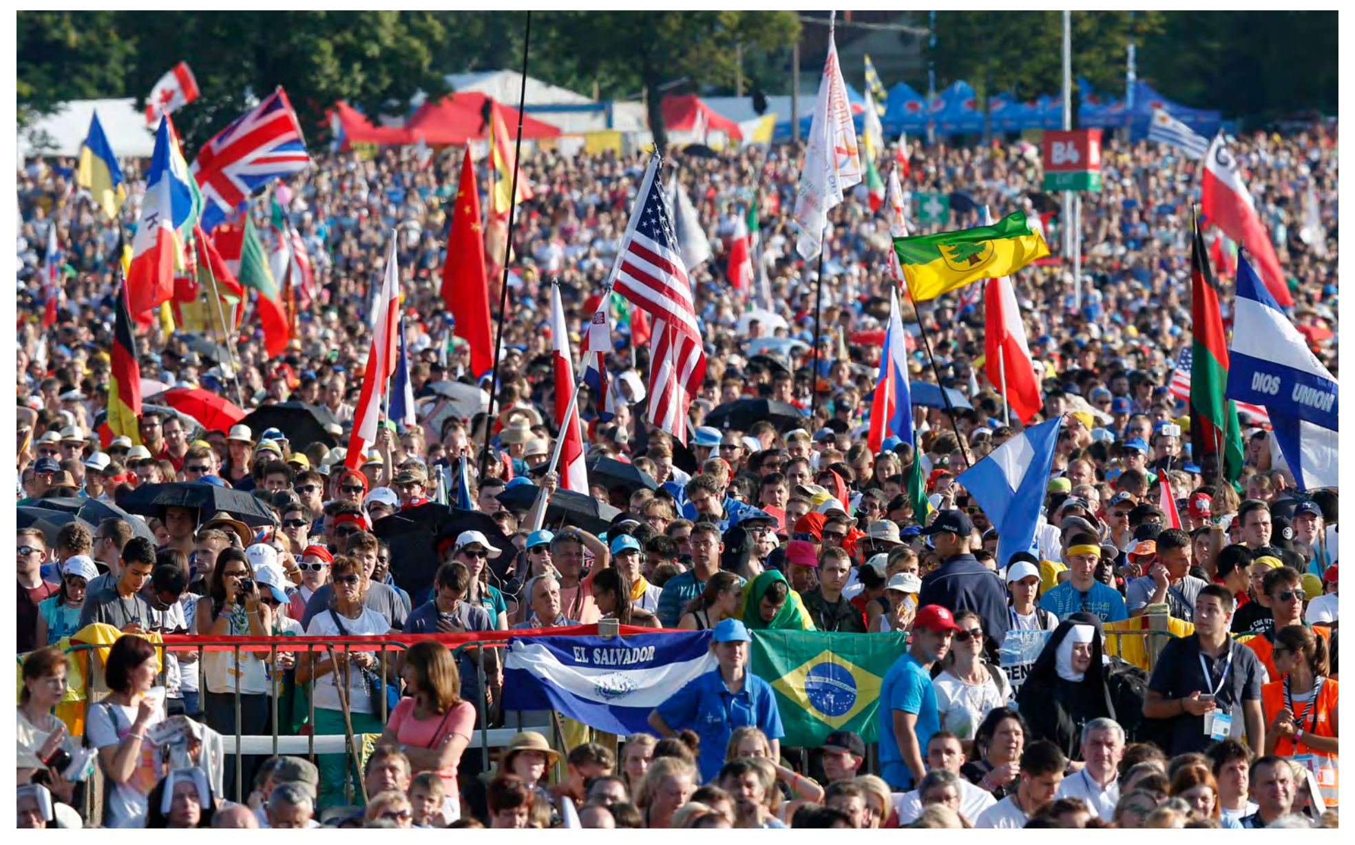
Pilgrims attend the Way of the Cross at World Youth Day in Blonia Park in Krakow, Poland, on July 29.

"Teach your elders well," pope says, calling youths to elevate the discourse