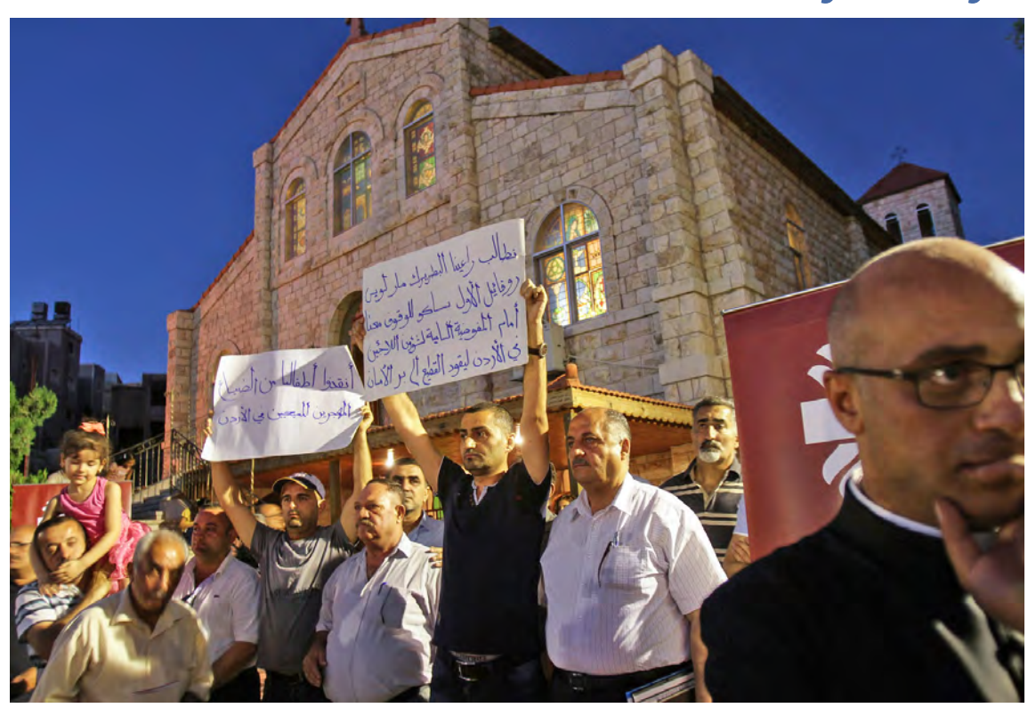
Iraqi Christian refugees holds banners during a prayer service in Fuheis, Jordan, to remember the first large exodus of Iraqi Christians targeted by the Islamic State group.

The patriarch is based in Lebanon, but oversees many of the