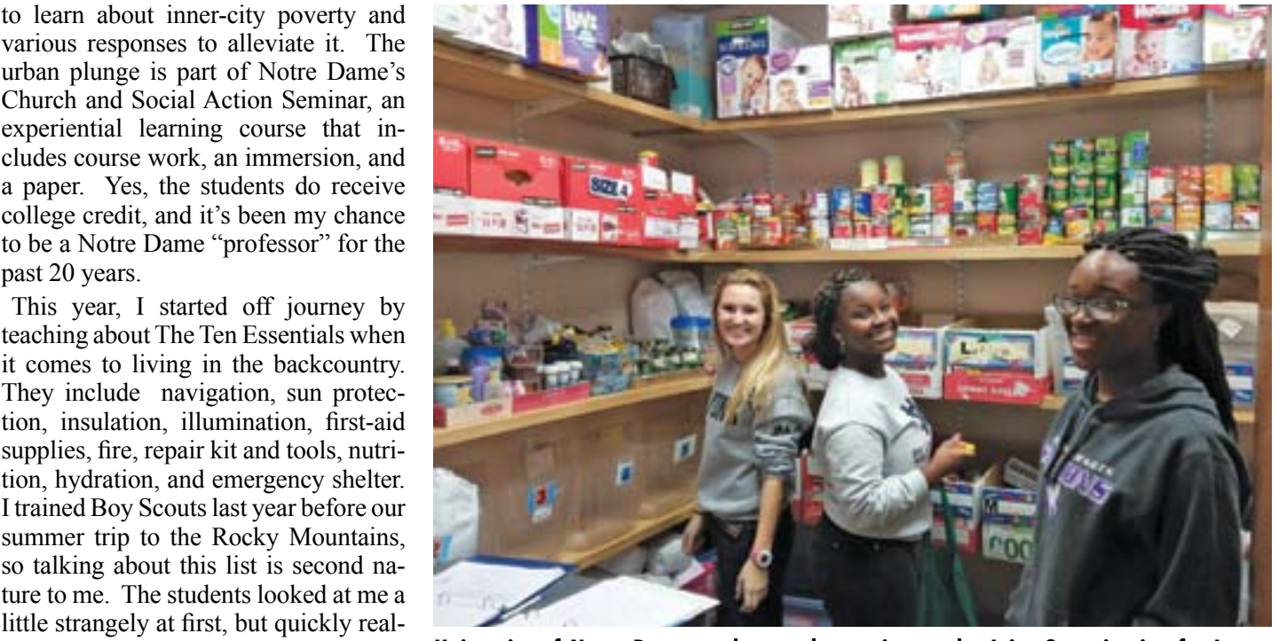
University of Notre Dame students volunteering at the Joint Organization for Inner-City Needs (JOIN) as part of their 48-hour urban plunge.

As we parked our van near a wooded area in the city, people came out – men, women, and, in one case, small children, in need of each of The Ten Essentials. In addition to food, they needed hand warmers, blankets, propane tanks, batteries, and especially toilet paper. Yes, toilet paper was a universal need that was in short supply.