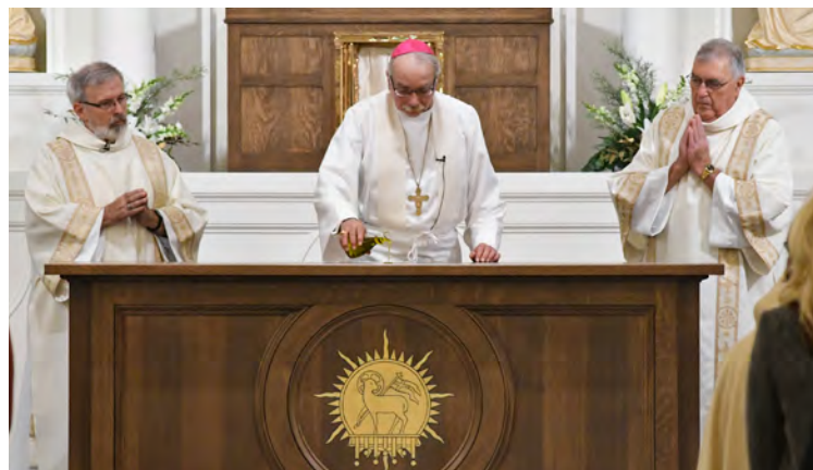
Above: Bishop Campbell anoints the altar with Sacred Chrism. Right: Liturgy of the Eucharist with concelebrating priests.

A baptismal font which had not been in use was restored, the confessionals were returned to their original location, new pews were installed, and new wood statues that were commissioned and hand-carved in Germany were put in place. In addition, the church was repainted, extensive repairs were made to the walls before painting, ductwork was