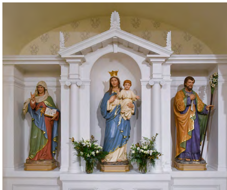
St. Ann, Mary and Jesus, and St. Joseph statues.

He and a team of parishioners discovered a blueprint for spiritual renewal by attending the Amazing Parish Conference in Denver in 2015. The parish is implementing what was learned at the conference by offering adult education programs which include the Alpha Course, which looks at the basics of Christianity, and the Walking with Purpose program of Bible study for women, and by adding to the worship experience through increased hospitality and the enhancements resulting from the restoration.