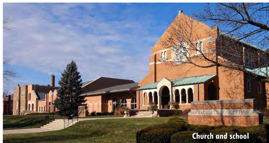
Church and school