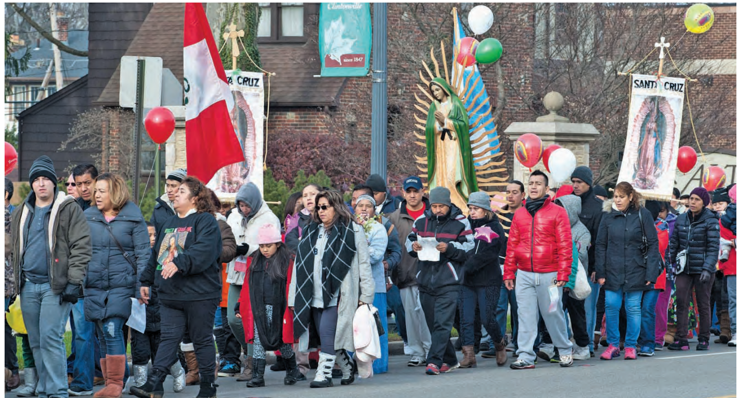
A scene from last year's Our Lady of Guadalupe procession in north Columbus, sponsored by Parroquia Santa Cruz.

Speaking in his indigenous language, Mary asked the future St. Juan Diego, an Aztec who was a Catholic convert, to convey to church leaders her desire for a church to be built on Tepayac Hill in what today is Mexico City. The Basilica of Our Lady of Guadalupe near the site, which was completed in 1976, is the most visited Catholic church in the world outside of St. Peter's Basilica in Rome.