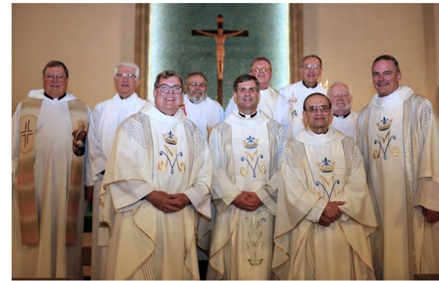
Diocesan priests who concelebrated Immaculate Conception Church's centennial Mass, and a view of the church's sanctuary taken during the Mass.

"It's a given that we have a strong religious emphasis," she said. "This includes an all-school Mass every Wednesday and penance services throughout the year, as well as all-school praying of the rosary at the grotto during the Marian months of October and May, Stations of the