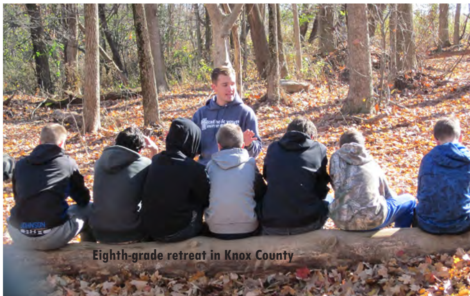
Eighth-grade retreat in Knox County