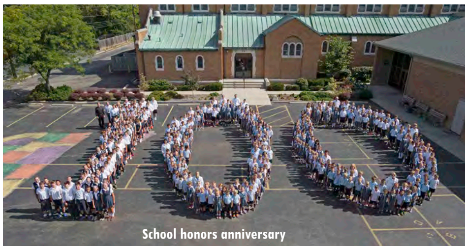
School honors anniversary