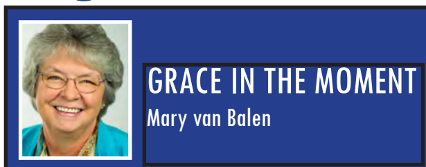
GRACE IN THE MOMENT Mary van Balen

Instead, I used beeswax vigil candles arranged on a round linen doily or tray covered with a deep blue napkin. The little pouches, feather, shells, and buffalo remained. A stone from the shores of the Sea of Galilee,