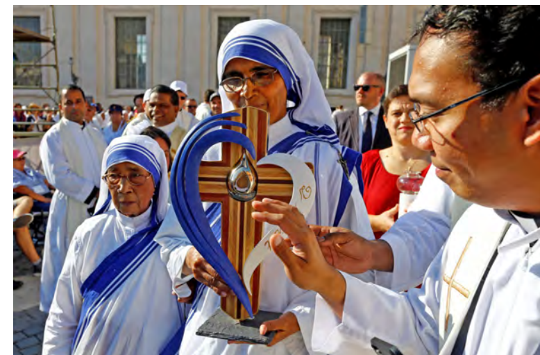
A Missionaries of Charity sister carries a relic of St. Teresa of Kolkata before Pope Francis celebrates her canonization Mass in St. Peter's Square at the Vatican on Sunday, Sept. 4.

The tiny, wizened Mother Teresa, in her familiar white-and-blue sari, opened houses for the destitute and dying, for those with AIDS, for orphans, and for people with leprosy. She founded houses in Cuba and the then-Soviet Union -- nations not generally open to foreign church