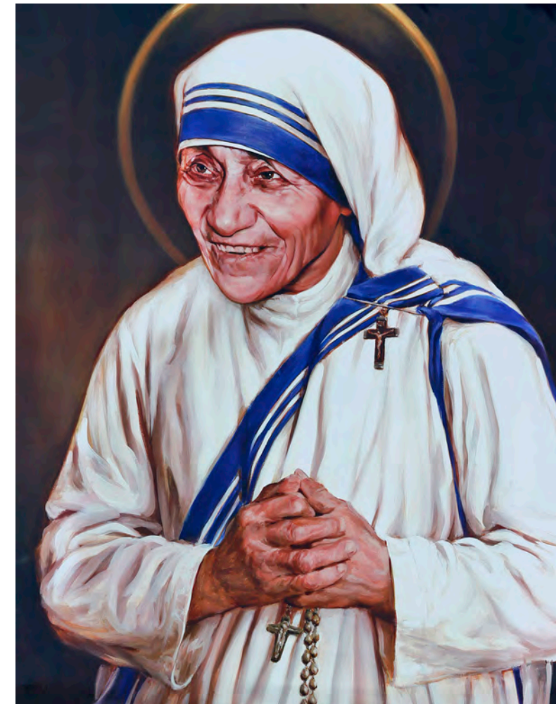
St. Teresa of Kolkata is pictured on a tapestry on the facade of St. Peter's Basilica as Pope Francis celebrates her canonization Mass in St. Peter's Square at the Vatican on Sunday, Sept. 4.

Mother Teresa: 'Do small things with great love'