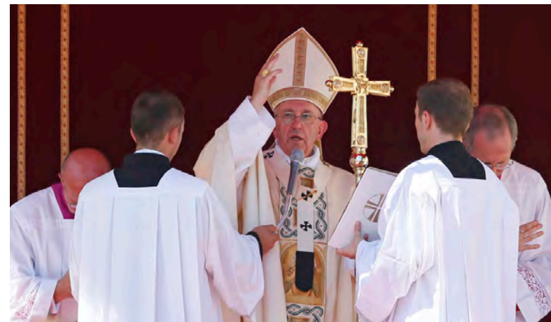
Above: Pope Francis celebrates the canonization of St. Teresa. Right: Part of the crowd in St. Peter's Square.