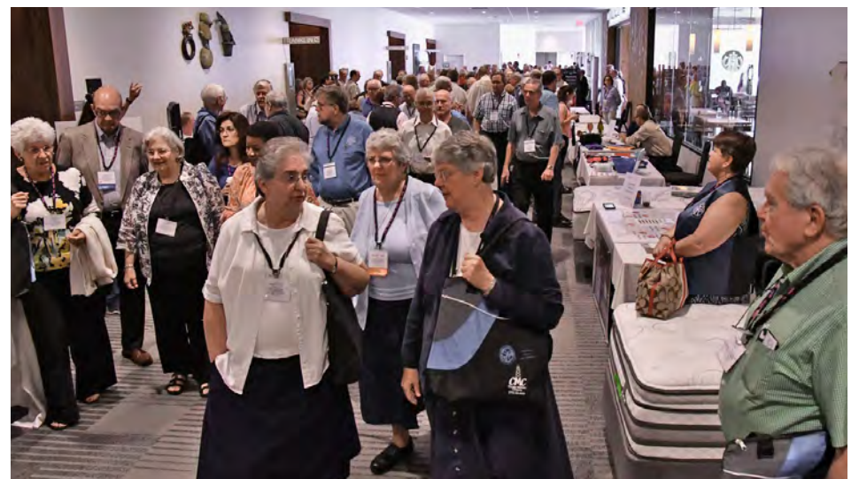
About 700 people from across the nation attended the assembly. Some are shown between sessions in an area for vendors of items related to the society’s work.